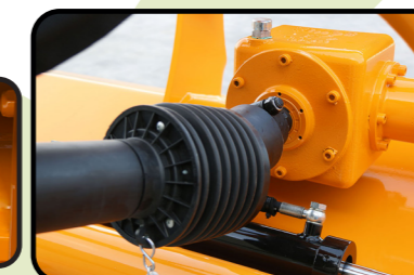
▶ Freewheel on transmission