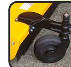
▶ Front wheels