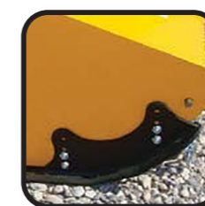
▶ Front skid shoes