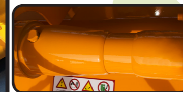
▶ Freewheel on sleeve