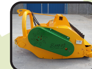
▶ Inclined side belt protection