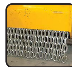
▶ Front chains