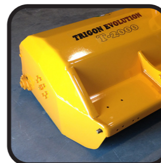
▶ Curved side