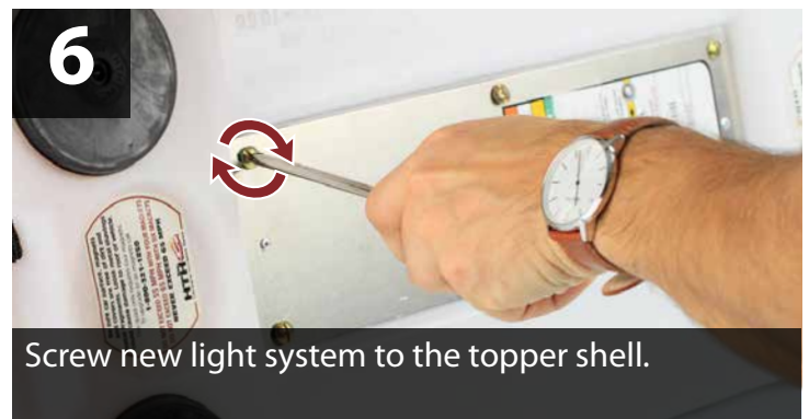
Screw new light system to the topper shell.

If you have questions please call 407.629.0012