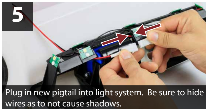
Plug in new pigtail into light system. Be sure to hide wires as to not cause shadows.