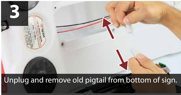
Unplug and remove old pigtail from bottom of sign.