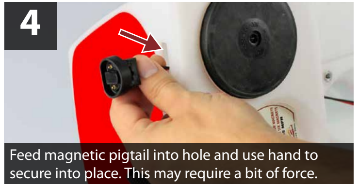
Feed magnetic pigtail into hole and use hand to secure into place. This may require a bit of force.