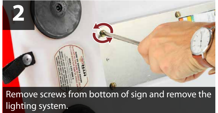
Remove screws from bottom of sign and remove the lighting system.