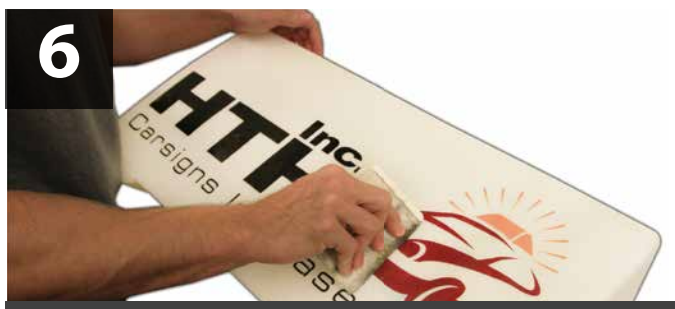
Use squeegee to press decal to the sign and remove excess water and air bubbles. Wipe away extra water.