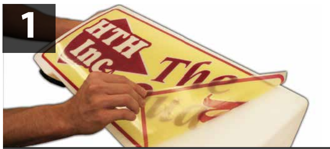
Remove the old decal by lifting one corner and peeling up and away from the sign. Discard decal.