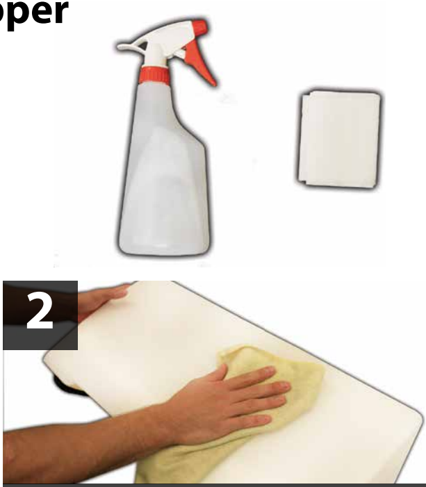
Clean the sign with the soap and water solution.