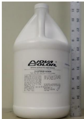
Nova Colors (referenced above)