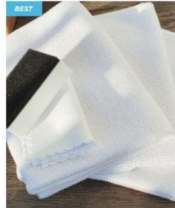
폼포나치 리빙타올 비딩타올 스웨이드 매트 1,000원 평점 4.9 · 리뷰 281