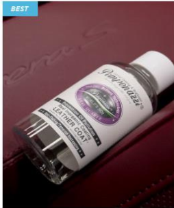
폼포나치 레더코트 자동차 가죽 코팅제 98,000원 평점 4.9 · 리뷰 6,972

인기도순 최신등록순 낮은 가격순 높은 가격순 할인율순 누적 판매순 리뷰 많은순 평점 높은순