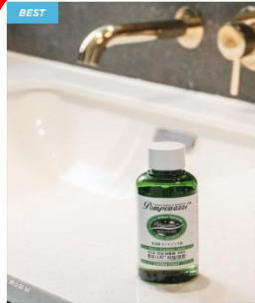
리빙코트 욕실패키지 주방 욕실코팅제 56,000원 평점 4.9 · 리뷰 6,456