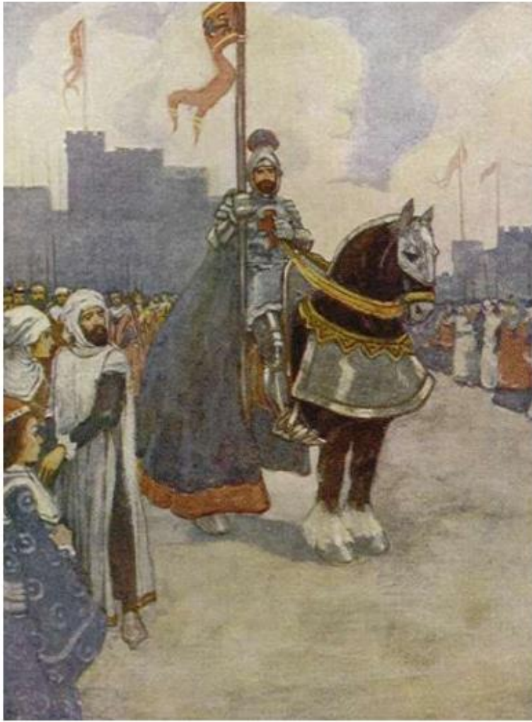
"RICHARD WENT AWAY TO PALESTINE"