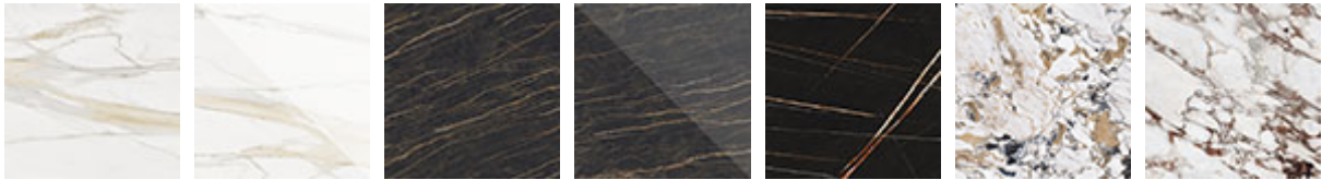
KM05 matt Golden Calacatta