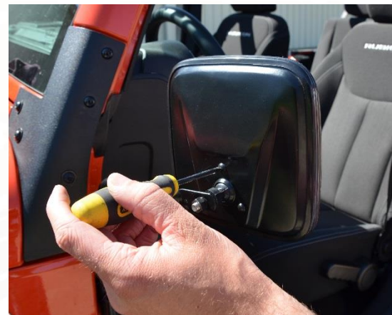
Figure 6: Mirror tension adjustment screw.