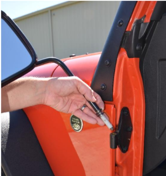
Figure 1: JK model - install SS washer, nylon washer, then plastic spacer on mirror arm.

Install a SS (stainless steel) washer then nylon washer onto the threaded end of the mirror arm. For the JK model only , also install the supplied plastic bushing (figure 1). This is not needed for CJ/YJ/TJ models (figure 2).