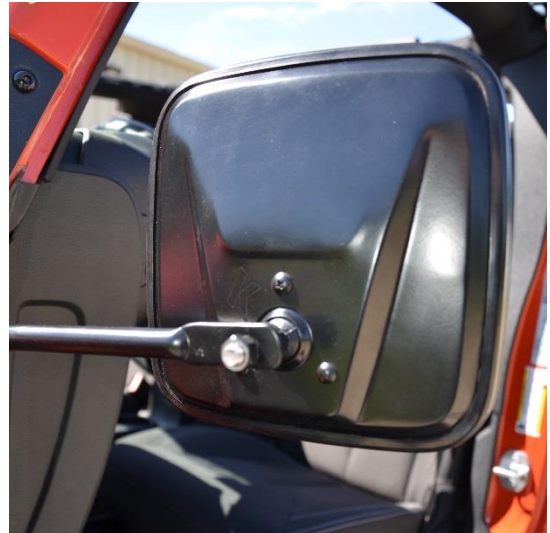
Figure 5: Mirror head installed on mirror arm assembly.

The tension of the mirror head can be adjusted using the top phillips head screw on the backside of the mirror (figure 6). DO NOT OVER TIGHTEN. The mirror should not be so tight that it cannot be adjusted.