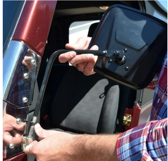
Figure 2: CJ / YJ / TJ model - install SS washer then nylon washer.

Install mirror arm into the door hinge. From the bottom, install another nylon and SS washer, followed by a nyloc nut. Make sure the nylon washers are sandwiched between the SS washers