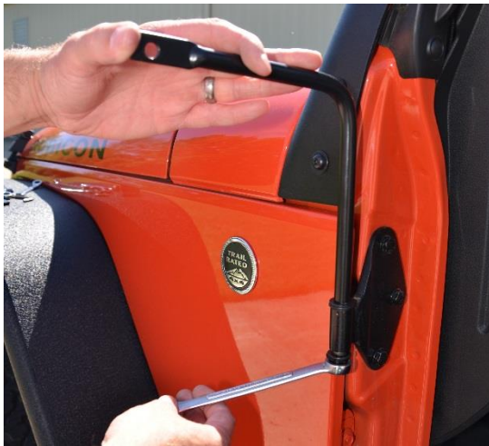
Figure 4: Tighten nyloc nut with 14mm wrench.

Tighten the nyloc nut using a 14mm wrench or socket while holding the mirror arm in place (figure 4). Tighten nut until the arm is snug in the door hinge but still loose enough to adjust the arm angle.