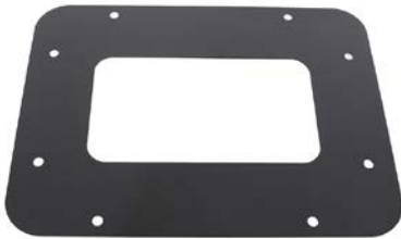
80703 Backside Mount