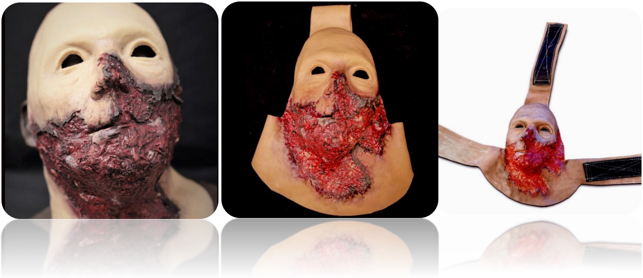
WW3-011 Burned Face – Full Mask Light, Medium, and Dark Skin Tones Available