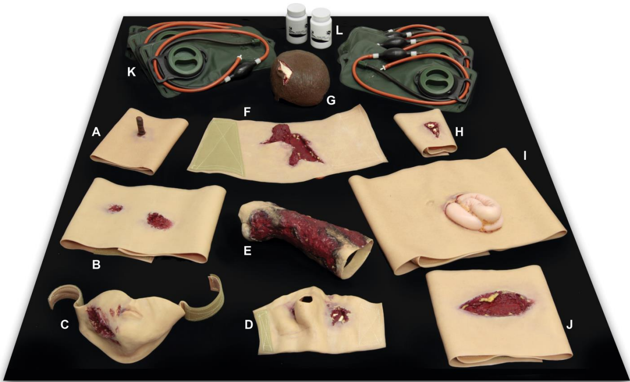
DELUXE MOULAGE KIT