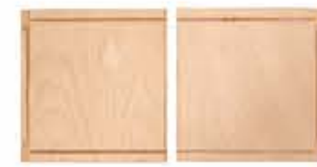
(2) Side Panels-(Part B)