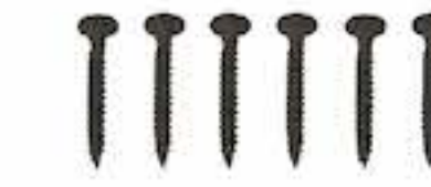
(6) Phillips screws (Part F)