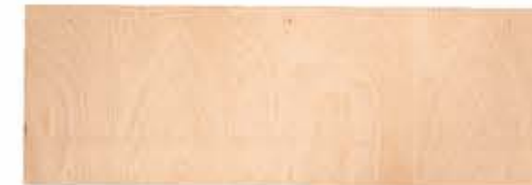
(1) Back Panel (Part D)