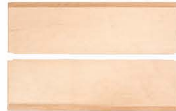
(2) Top & Bottom Panels-(Part C)