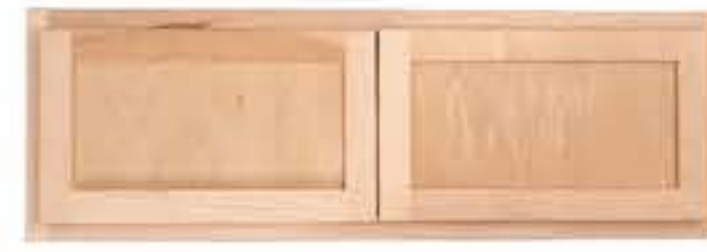
(1) Door & Frame Assembly-(Part A)