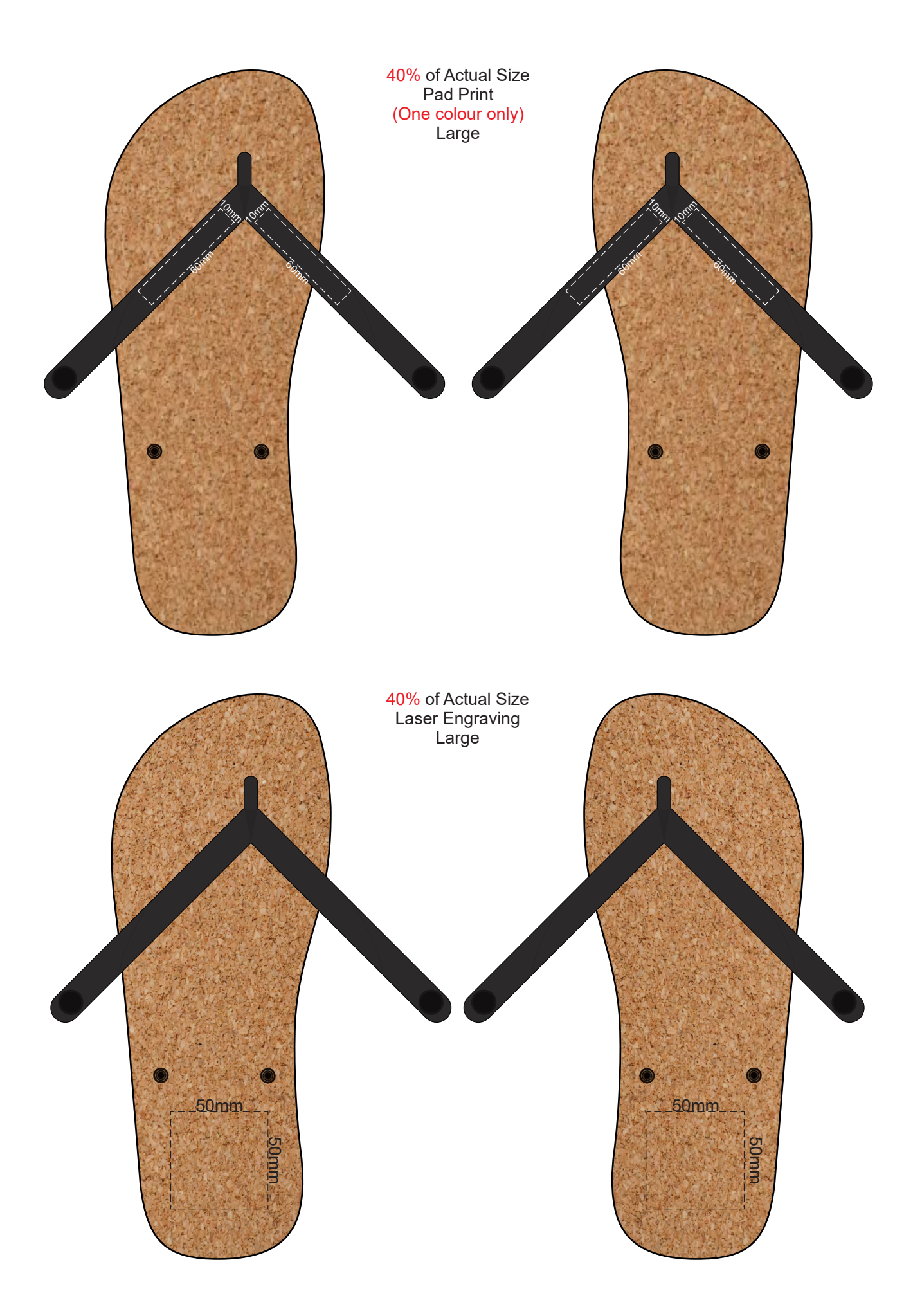
This product is a natural material, please allow for variances in grain pattern and branding.