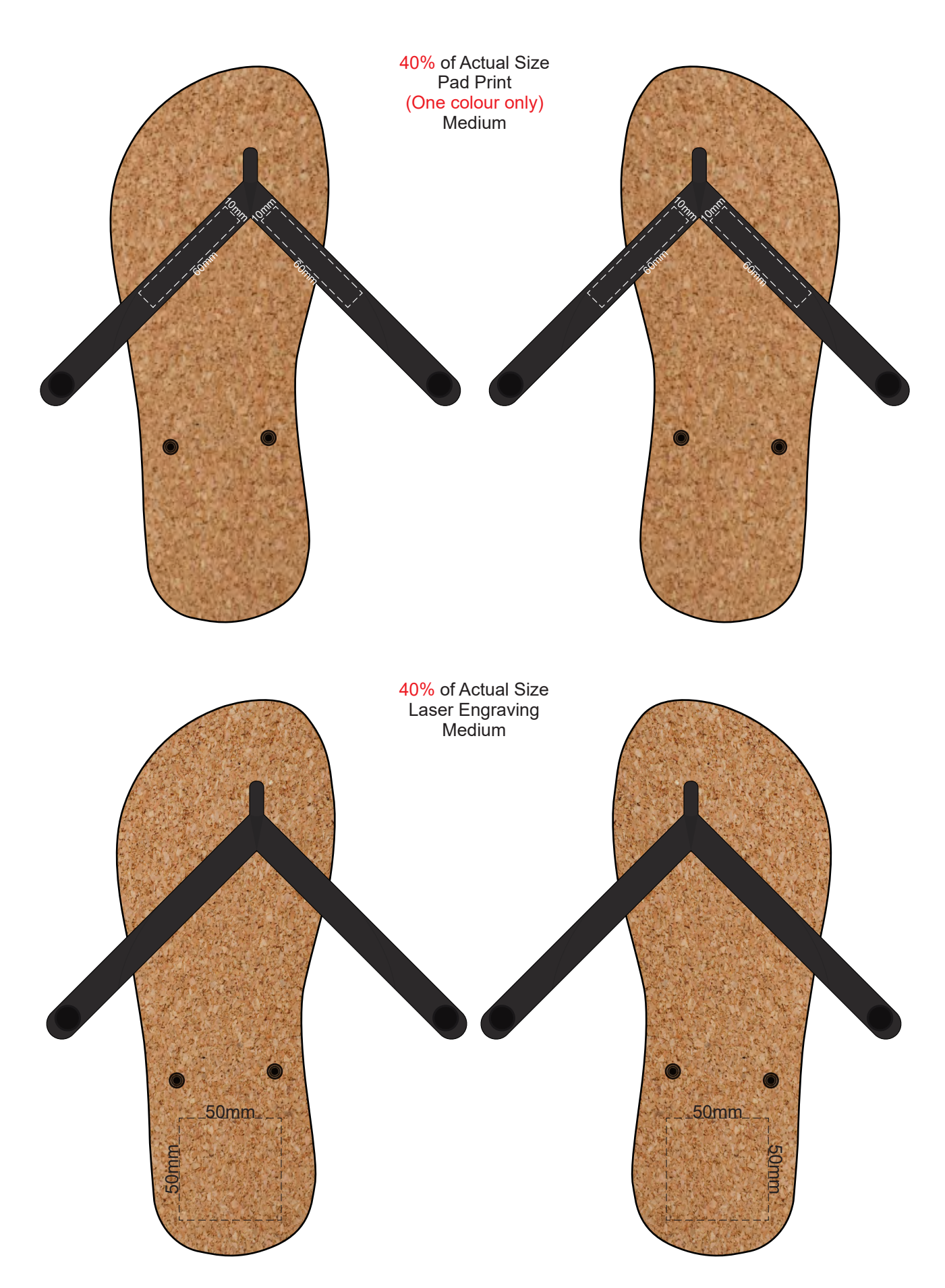
This product is a natural material, please allow for variances in grain pattern and branding.