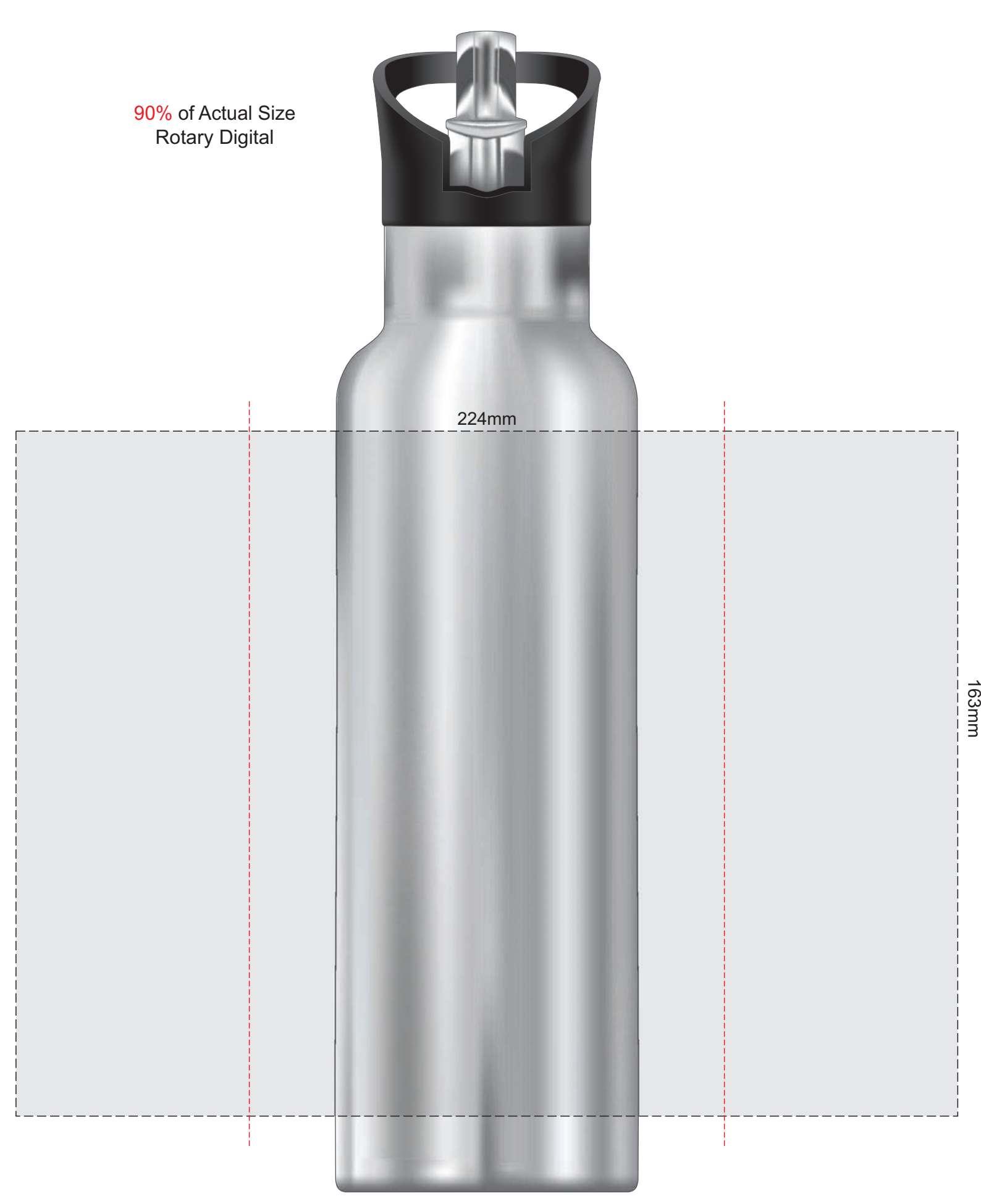
Red Line = Exact opposites of the product (centre artwork to the red line)