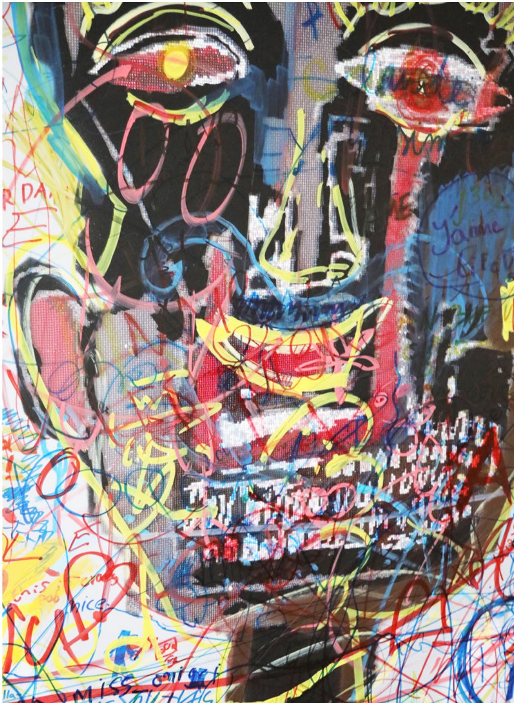
Duran Lantink, Jean-Michel Basquiat