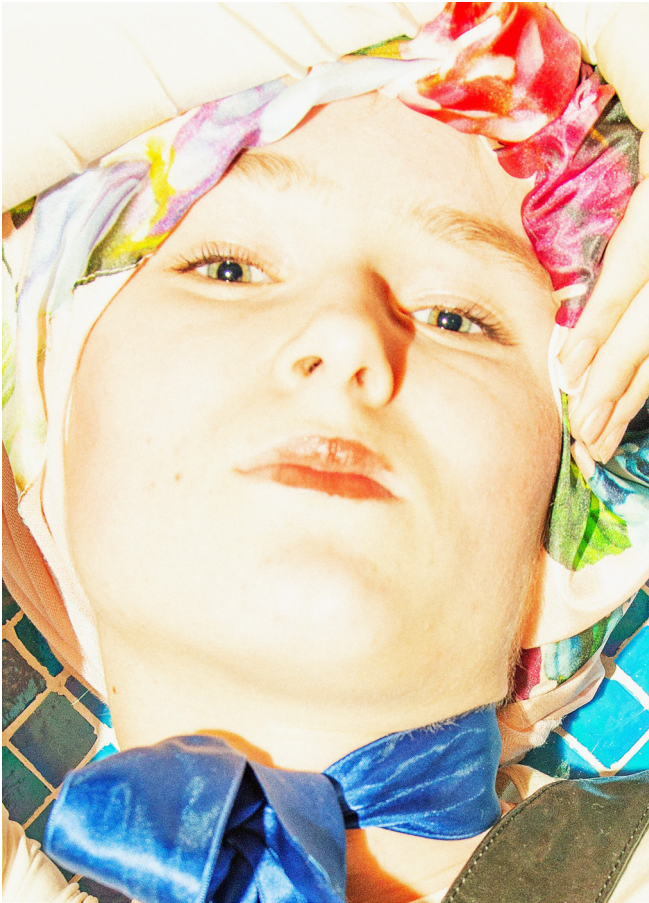
britt (blue ribbon), 2021 fine art inkjet print edition of three 94 x 130 cm