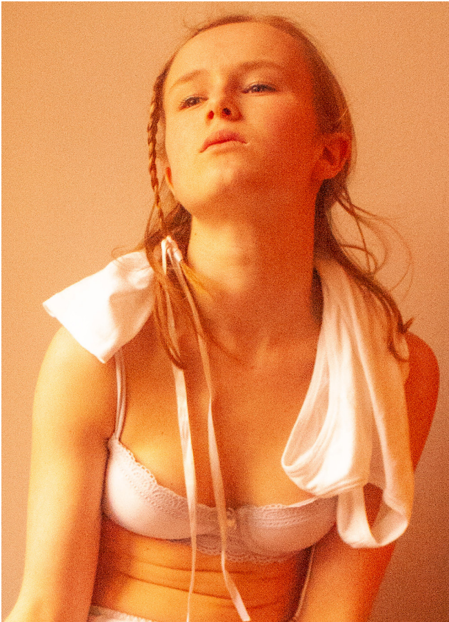
britt (bra/ribbons), 2021 fine art inkjet print edition of five 38 x 53,2 cm