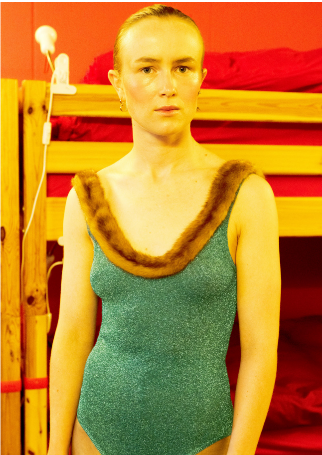
britt (glitters), 2021 fine art inkjet print edition of five 38 x 53,2 cm