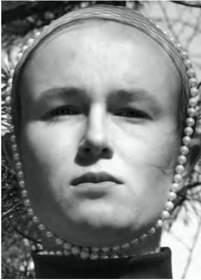
britt (pearls) #2, 2021 fine art inkjet print edition of five 38 x 53,2 cm