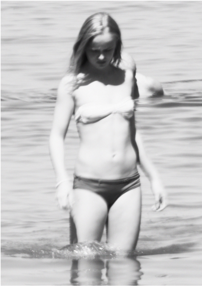
britt (water/man), 2021 fine art inkjet print edition of five 38 x 53,2 cm