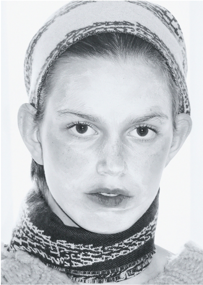
floor (scarves) #3, 2021 fine art inkjet print edition of five 38 x 53,2 cm