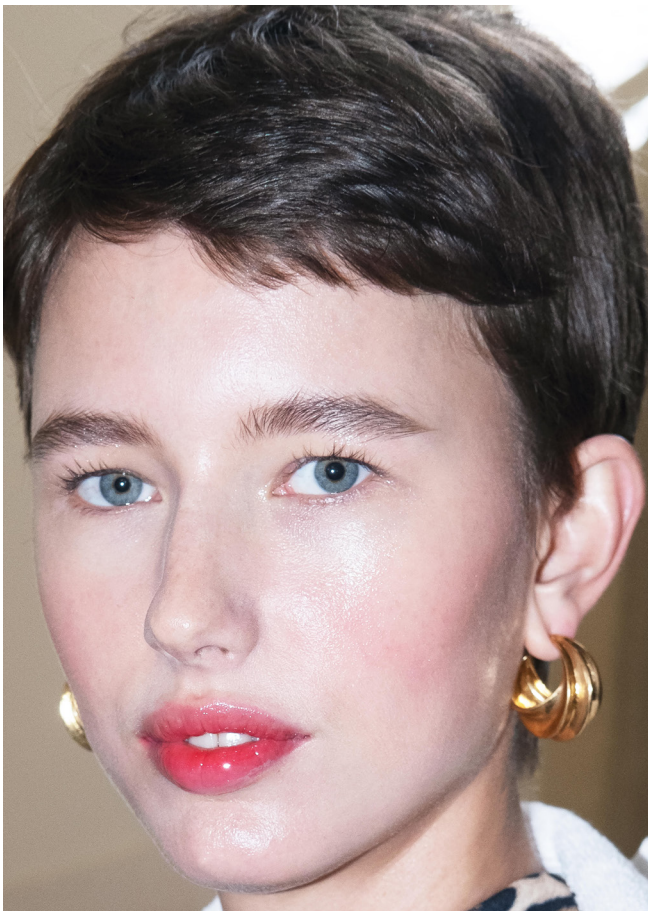
nora (hoops), 2021 fine art inkjet print edition of five 38 x 53,2 cm