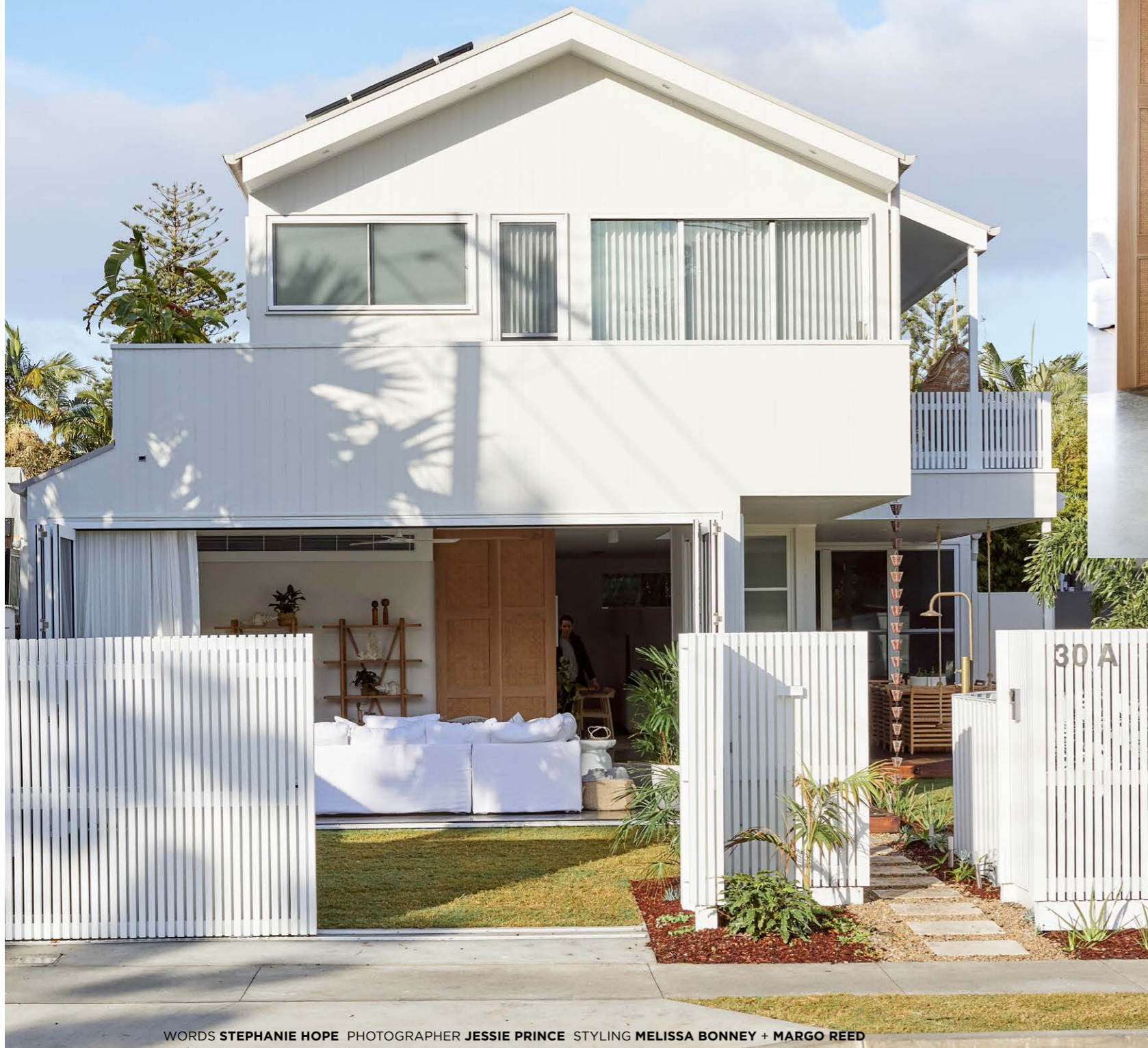
WORDS STEPHANIE HOPE STYLING MELISSA BONNEY + MARGO REED

Create year-round vacay vibes with these simple design tricks