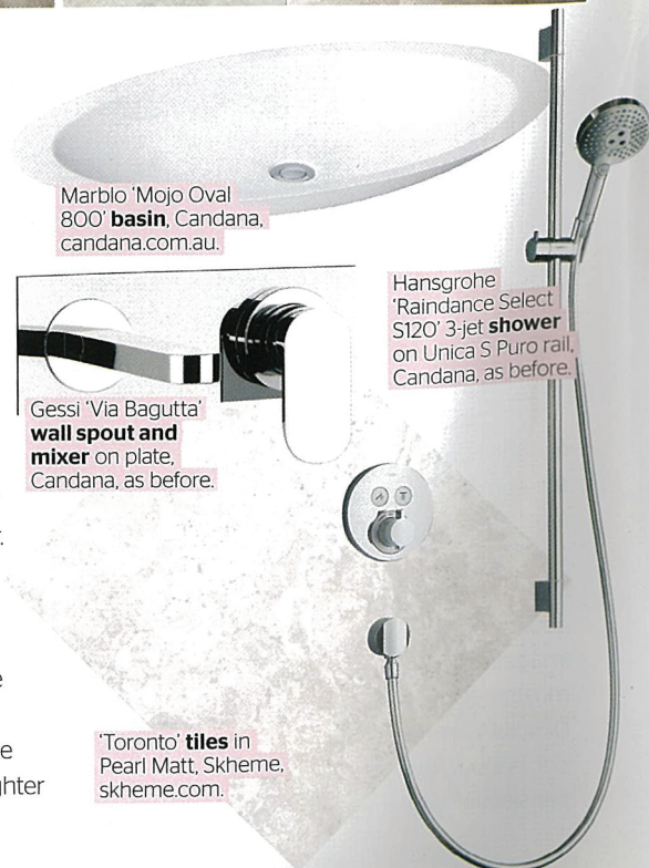
Marblo 'Mojo Oval 800' basin, Candana, candana.com.au .

the hardware Melissa specified a linear drain with inset tiles in the open shower. "Linear drains are highly functional as they allow water to run across the full width of the drain instead of all the flooring angling into one small drainage point," she says. Mixer taps and shower heads are in chrome, with a Caesarstone benchtop in Grey Concrete, adding a lighter counterpoint to the tiles and timber.