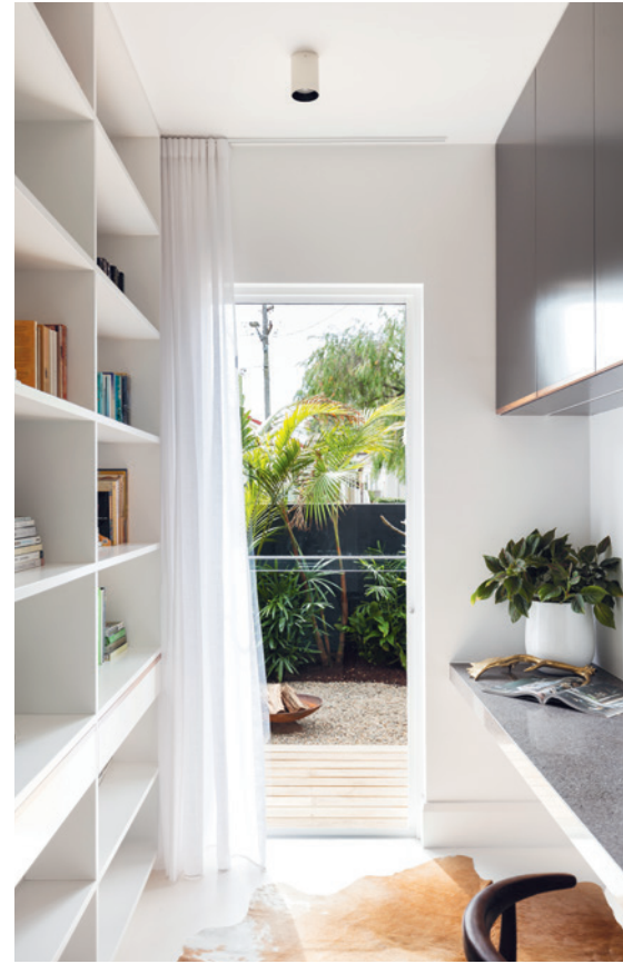
A concealed study is kept clutter free thanks to custom-designed joinery.