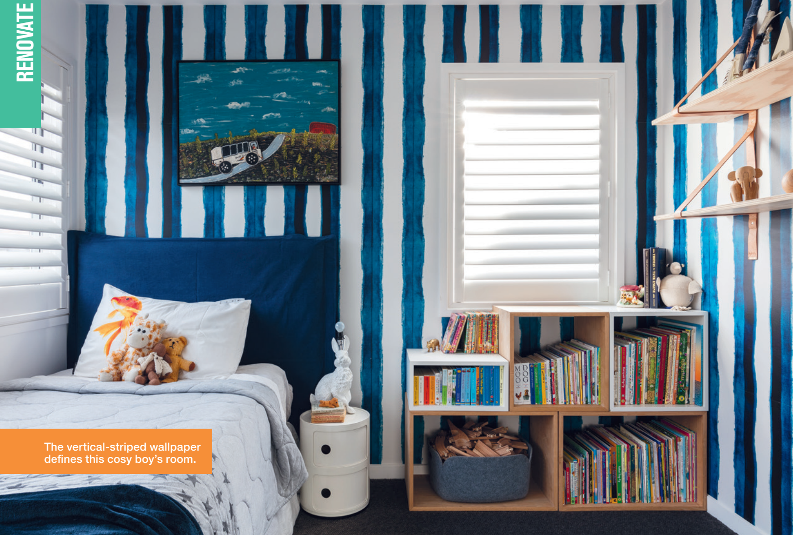
The vertical-striped wallpaper defines this cosy boy's room.