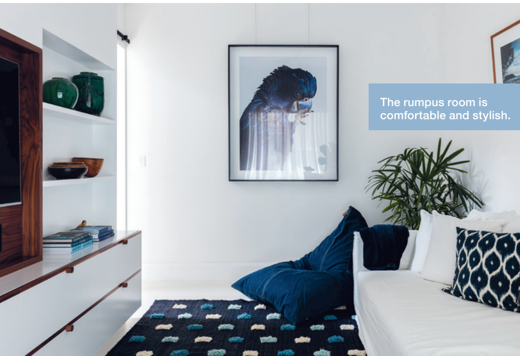
The rumpus room is comfortable and stylish.