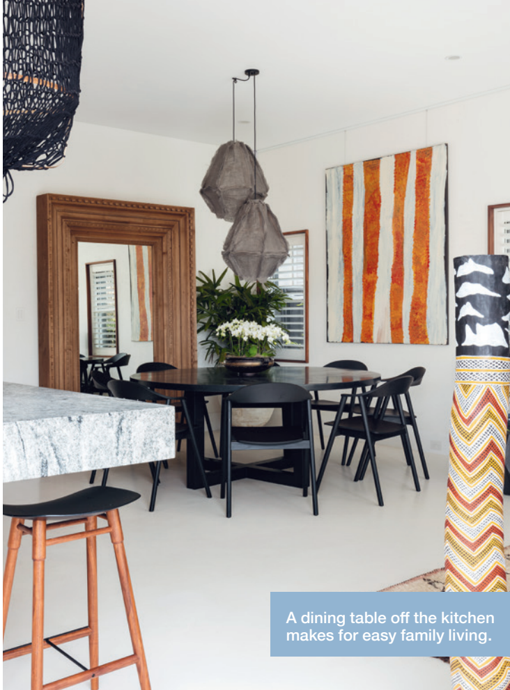
A dining table off the kitchen makes for easy family living.