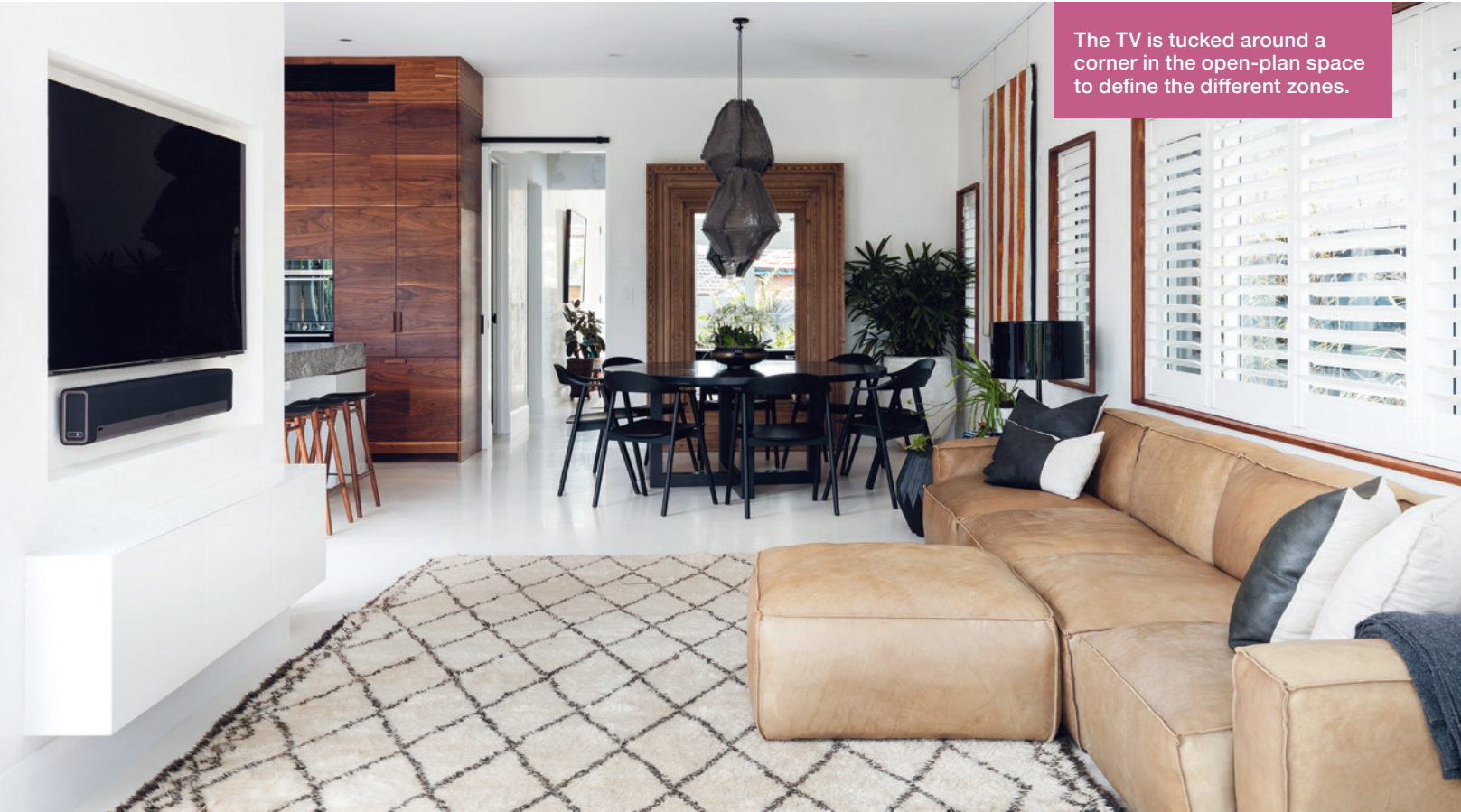
The TV is tucked around a corner in the open-plan space to define the different zones.