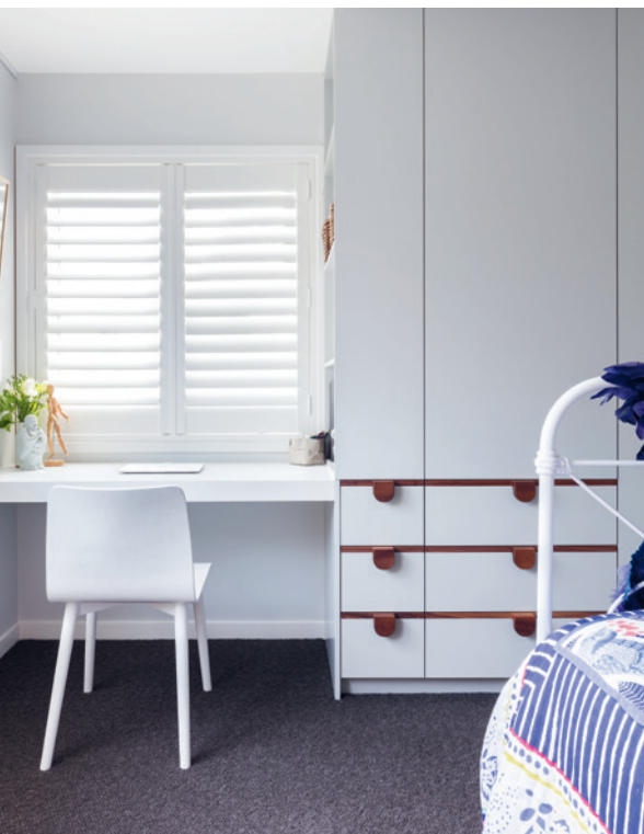
Practical and simple design solutions tailored to each child will always work well.