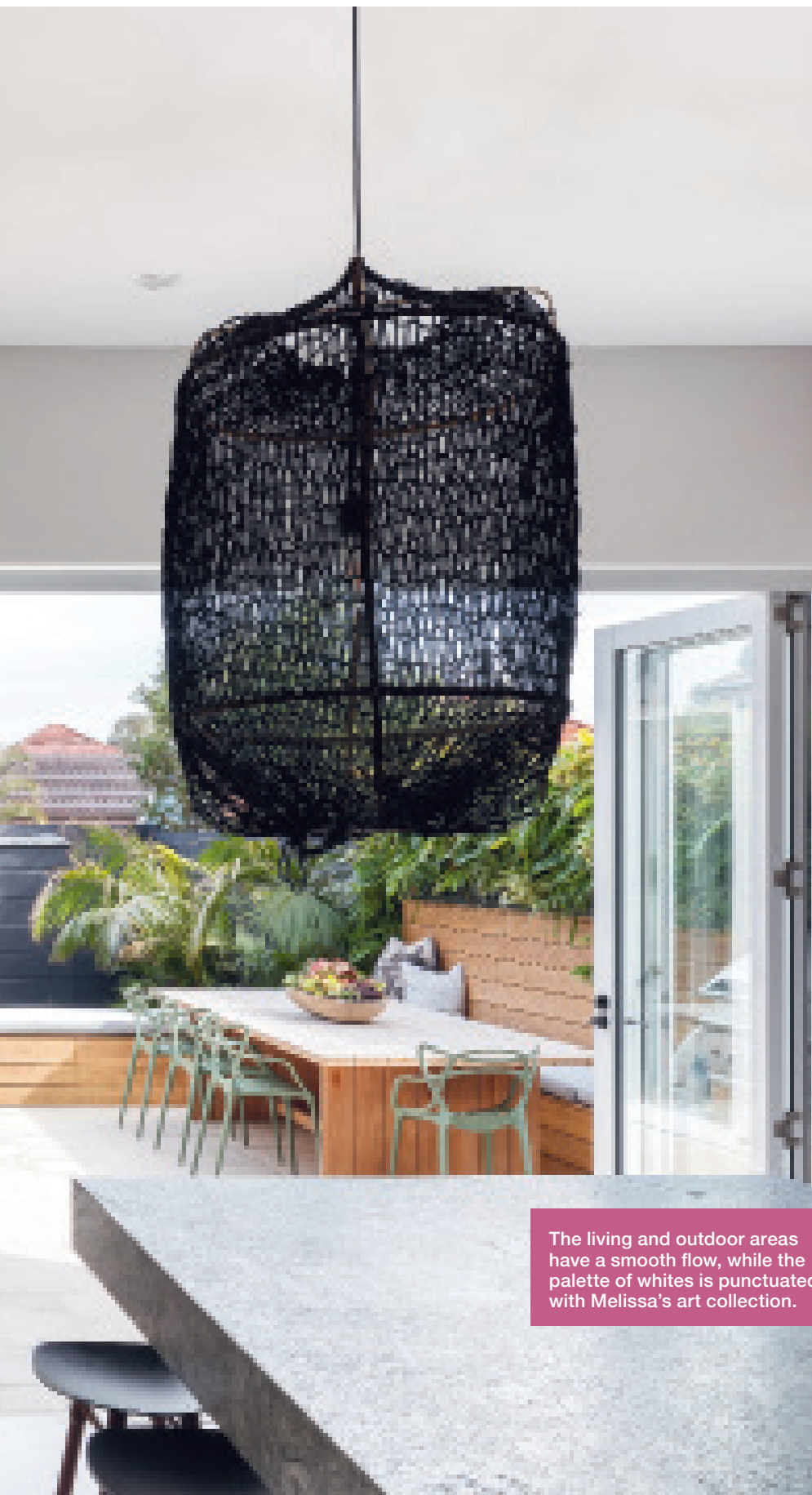
The living and outdoor areas have a smooth flow, while the palette of whites is punctuated with Melissa's art collection.