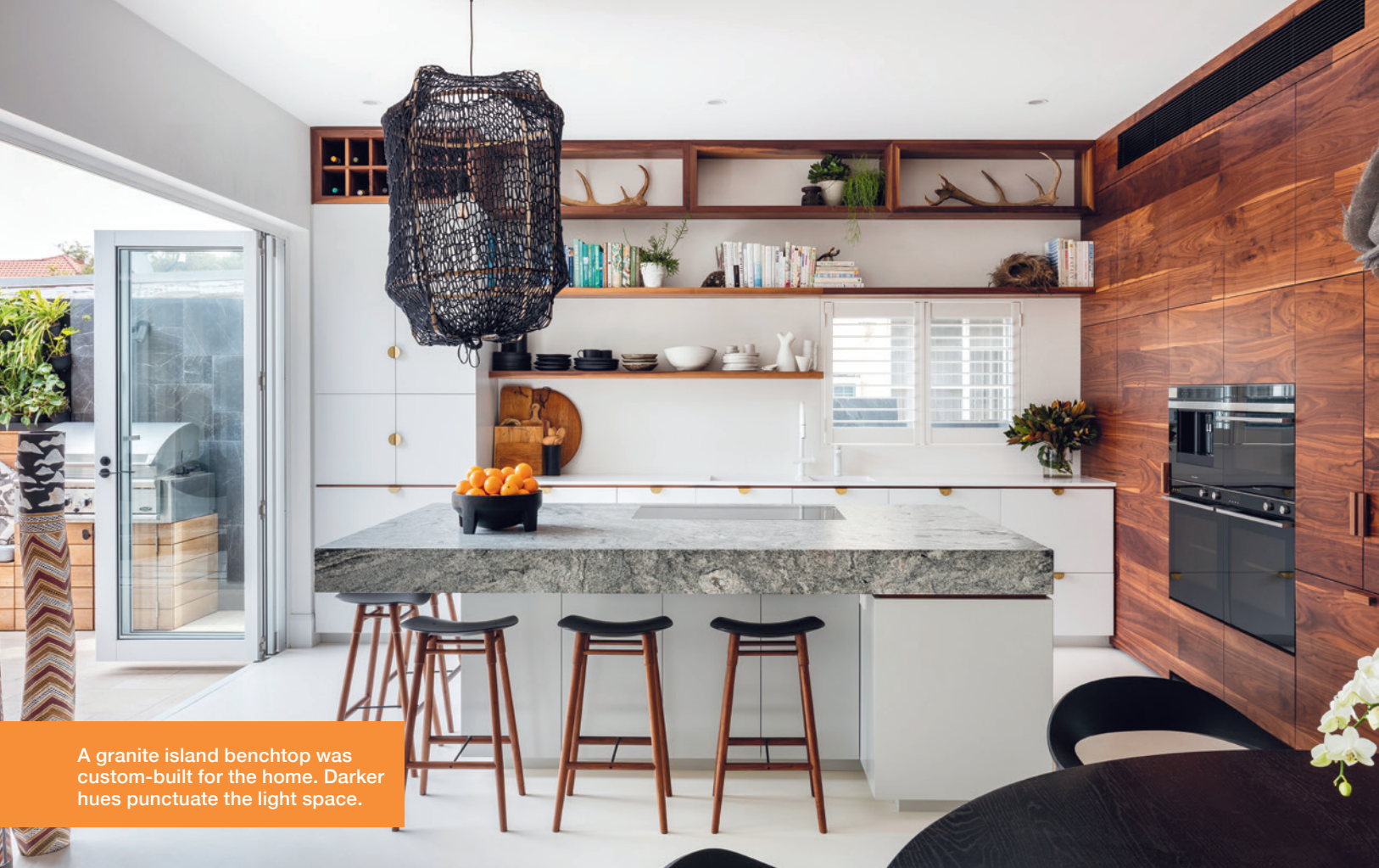
A granite island benchtop was custom-built for the home. Darker hues punctuate the light space.