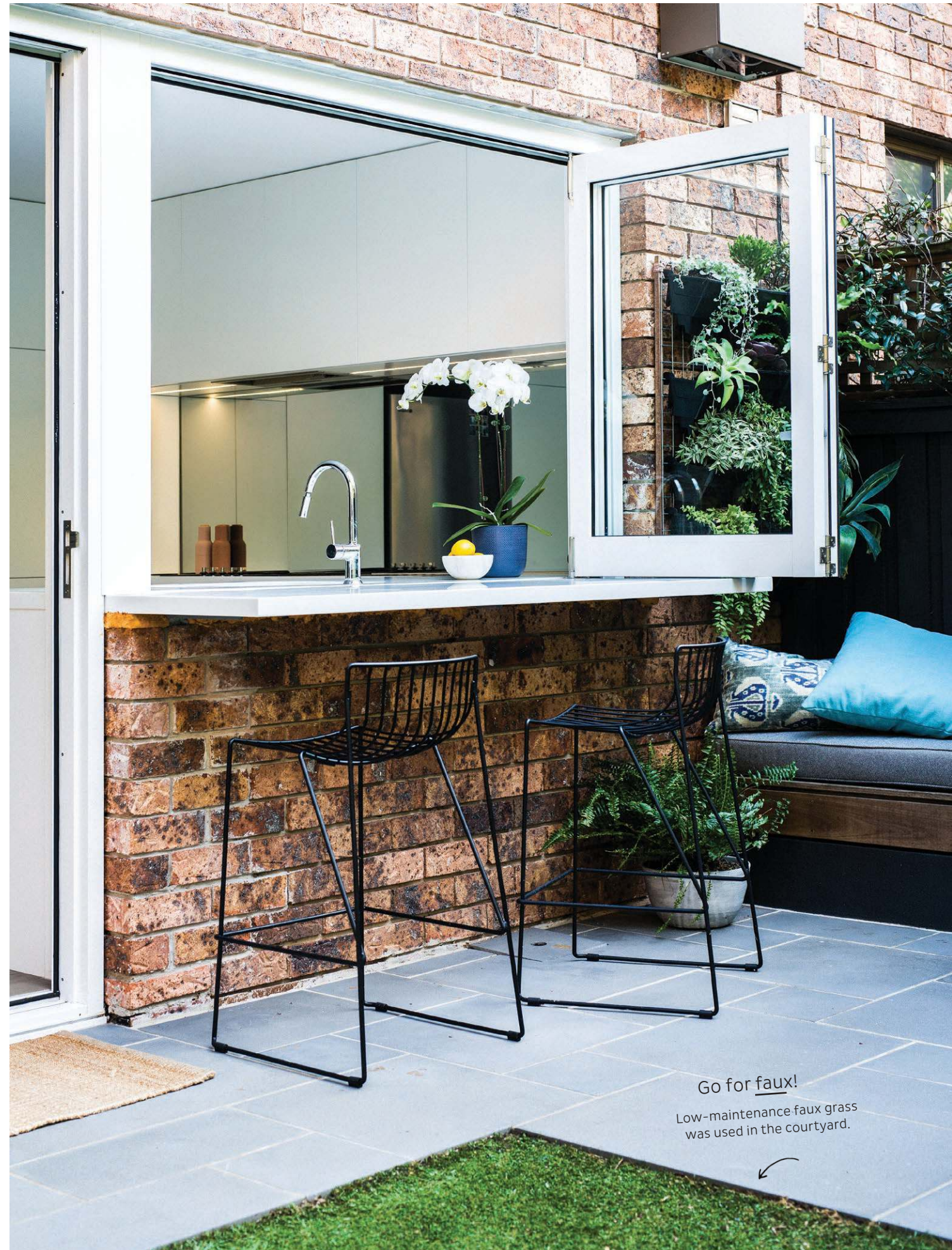
Go for faux! Low-maintenance faux grass was used in the courtyard.