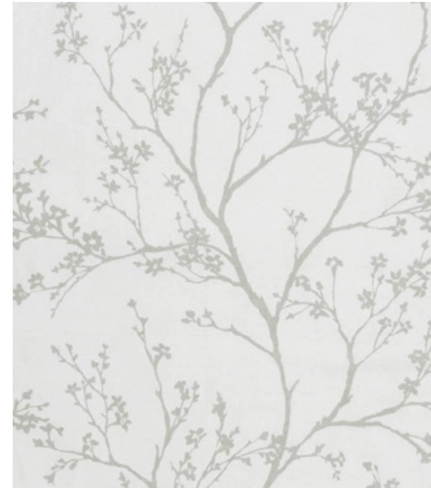
LIGHT GREY 178440

WIDTH 116 1/2" (296CM) VERT REPEAT 17 3/4" (45CM) HORZ REPEAT 14 7/8" (38CM) MATCH Straight- Shown as Railroaded CONTENTS 100% Linen COUNTRY Spain CARE Machine Washable 30°C APPLICATION Windows