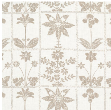
GEORGIA WILDFLOWERS Neutral 180891 Fabric