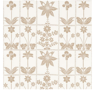
GEORGIA WILDFLOWERS Neutral 5014821 Wallcovering