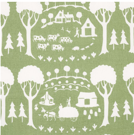
FARM SCENE Green 180880 Fabric