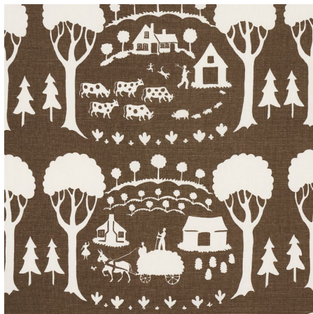
FARM SCENE Brown 180881 Fabric