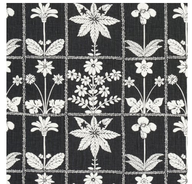
GEORGIA WILDFLOWERS Black 180893 Fabric