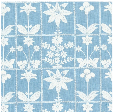
GEORGIA WILDFLOWERS Blue 180892 Fabric