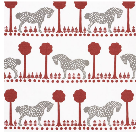
POLKA DOT PONY Red 180903 Fabric