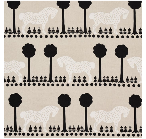
POLKA DOT PONY Natural 180902 Fabric