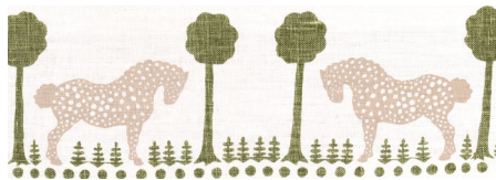
POLKA DOT PONY TAPE Olive 82812 Trim