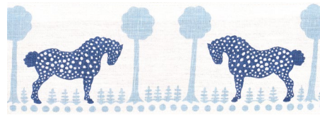
POLKA DOT PONY TAPE Blue 82811 Trim