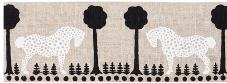
POLKA DOT PONY TAPE Natural 82810 Trim