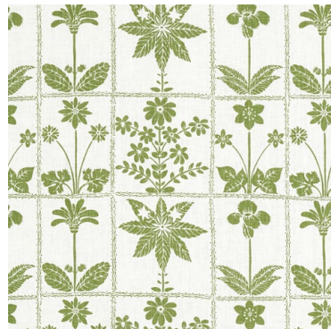
GEORGIA WILDFLOWERS Leaf 180890 Fabric