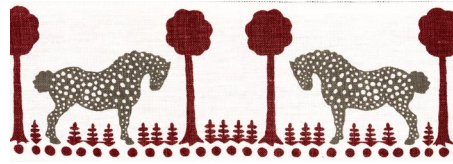
POLKA DOT PONY TAPE Red 82813 Trim