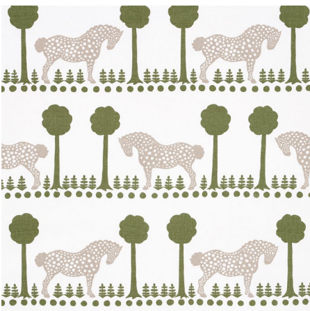
POLKA DOT PONY Olive 180900 Fabric