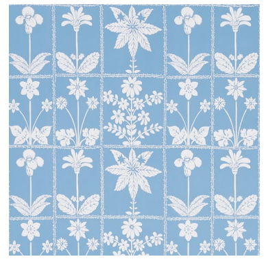
GEORGIA WILDFLOWERS Blue 5014820 Wallcovering