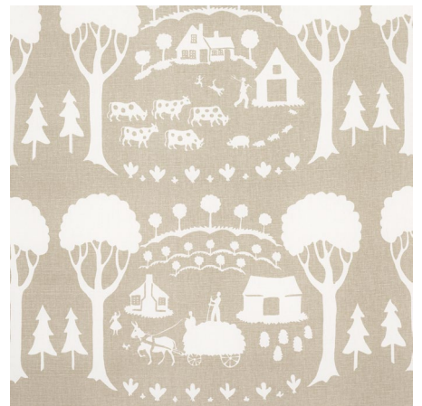
FARM SCENE Neutral 180882 Fabric