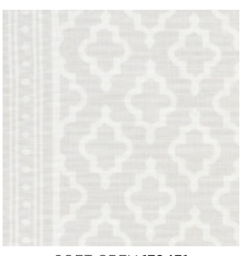
SOFT GREY 178431