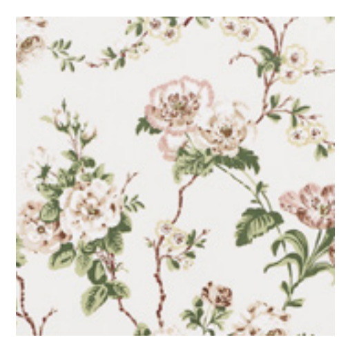
QUIET PINK 178400