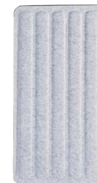
Straight Screen Charcoal over light grey