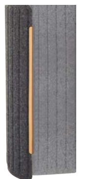
U shape end cap