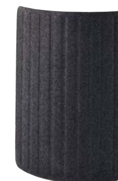
Curved Screen Charcoal over light grey

FDPET5614CH 560 X 1400H SEACHANGE SCREEN STRAIGHT CHARCOAL / LIGHT GREY