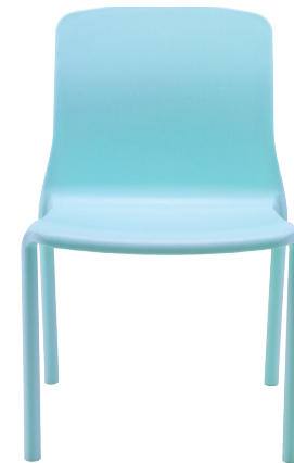
Adult side chair Code: ICCFLOSBLU460 Seat Height - 460mm