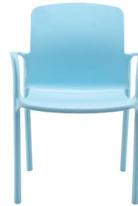
Adult Arm chair Code: ICCFLOABLU460 Seat Height - 460mm

Anti-tilt legs, designed to cover a large surface area for increased stability