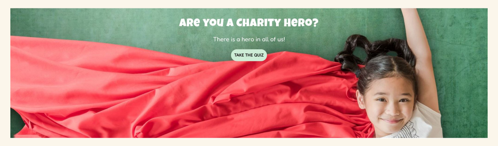
<u>Charity Hero - Take the Quiz - Charitable Choice Limited</u>

This quiz helps kids identify causes they feel strongly about: