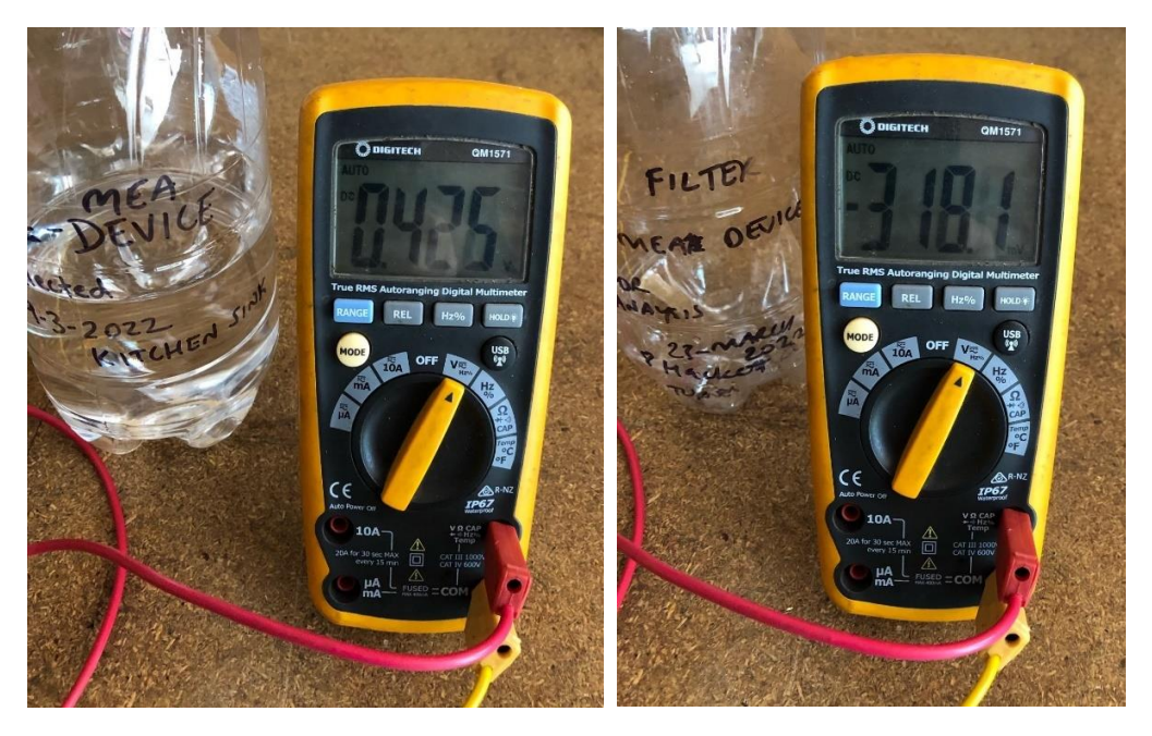
Figure 4. Phi'on Laboratory test results for water sample taken 4 weeks after MEA device installation. The left image is the voltage (+425mV) of the sink tap water before the MEA device was installed. The right image is the voltage (-318mV) from sink water after the MEA water device was installed.

However, if we consider water in a highly ordered phase as described above, the ratio becomes H_3O_2 , which is has a negative balance. Therefore, a permanent negative charge indicates highly ordered, hexagonal, structured water.<sup>38</sup> The Phi'on laboratory verified the net negative charge (-mV) of the water using their specifically developed testing technology and methodology (see images below).