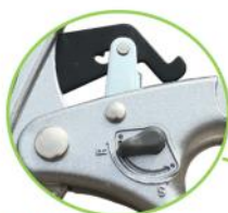
Ratchet Mode — 4 Short Cut Ratcheting Action 50% Effort Saving and great for thicker branches up to 22mm