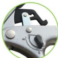
Quick Cut Single Cut Mode — 1 Cut Conventional Cutting Action Great for branches up to 18mm when ratcheting action is not required