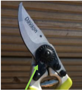
1) Full Lock Position