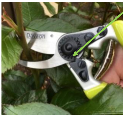
Half Open Position

1) Repeat 2 and 4 above but move lock to half open position as shown in image