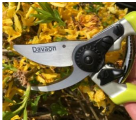
Full Open Position