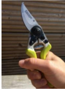
2) Squeeze Handles