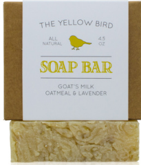
Goat's Milk Oatmeal Lavender Soap Bar [$5.00] $10.00 4.5 oz