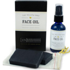
Argan Face Oil Set [$15.50] $30.00 4 oz