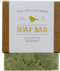
Eucalyptus Spearmint Soap Bar [$5.00] $10.00 4.5 oz