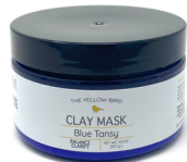
Blue Tansy Clay Face Mask [$11.50] $22.00 3.8 oz