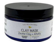
Zeolite & Alfalfa Clay Mask [$11.50] $22.00 3.8 oz