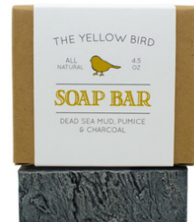
Dead Sea Mud, Pumice, Charcoal Soap Bar [$5.00] $10.00 4.5 oz