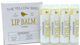
All Natural Lip Balm Peppermint 4-Pack [$6.50] $12.00 1 oz