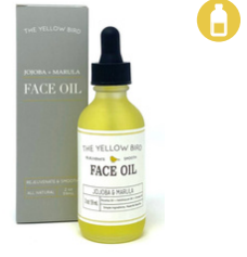
Jojoba + Marula Face Oil [$14.50] $25.00 2 oz