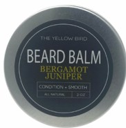
Bergamot Juniper Beard Balm and Conditioner [$6.50] $12.99 2 oz