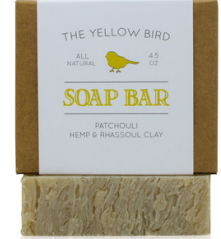
Patchouli, Hemp, Rhassoul Clay Soap Bar [$5.00] $10.00 4.5 oz