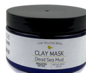
Dead Sea Mud Clay Mask [$11.50] $22.00 3.8 oz