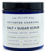
Activated Charcoal Salt + Sugar Scrub [$7.50] $14.99 10 oz