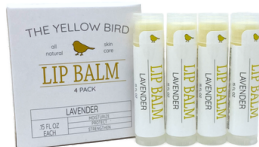
All Natural Lip Balm Lavender 4-Pack [$6.50] $12.00 1 oz