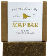
Pine Tar, Cypress, Orange Soap Bar [$5.00] $10.00 4.5 oz