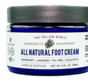
All Natural Foot Cream [$8.75] $16.99 4 oz