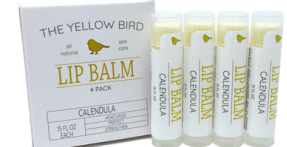
All Natural Lip Balm Calendula 4-Pack [$6.50] $12.00 1 oz