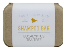
Eucalyptus Tea Tree Shampoo Bar [$5.00] $10.00 4.5 oz