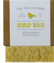
Neem Geranium Soap Bar [$5.00] $10.00 4.5 oz