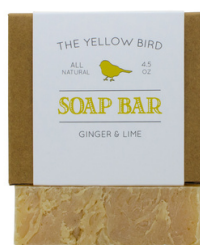
Ginger Lime Soap Bar [$5.00] $10.00 4.5 oz