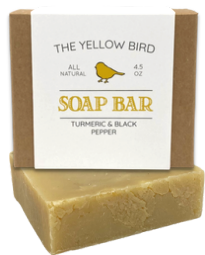
Turmeric & Black Pepper Soap Bar [$5.00] $10.00 4.5 oz