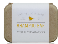
Citrus Cedarwood Shampoo Bar [$5.00] $10.00 4.5 oz