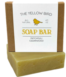
Patchouli Cedarwood Soap Bar [$5.00] $10.00 4.5 oz