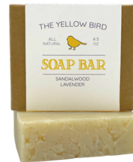
Sandalwood Lavender Soap Bar [$5.00] $10.00 4.5 oz