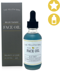
Blue Tansy Face Oil [$14.00] $22.00 2 oz