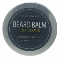
Fir Clove Beard Balm and Conditioner [$6.50] $12.99 2 oz