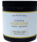
Coffee Sugar Scrub [$7.50] $14.99 10 oz