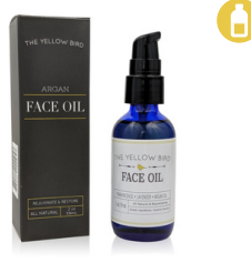
Argan Face Oil Single [$14.50] $25.00 2 oz