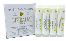
All Natural Lip Balm Variety Pack (1 of each) [$6.50] $12.00 1 oz