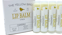
All Natural Lip Balm Chamomile 4-Pack [$6.50] $12.00 1 oz