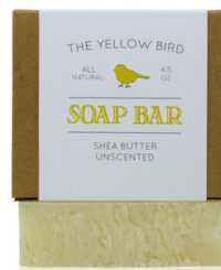
Unscented Shea Butter Soap Bar [$5.00] $10.00 4.5 oz