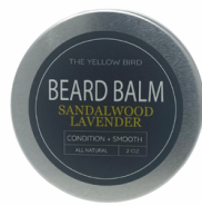
Sandalwood Lavender Beard Balm and Conditioner [$6.50] $12.99 2 oz