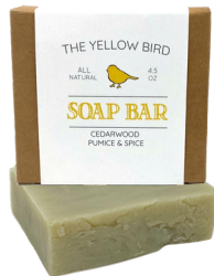
Cedarwood Pumice & Spice Soap Bar [$5.00] $10.00 4.5 oz