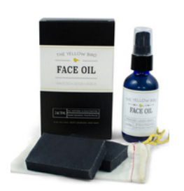
Argan Face Oil Set [ $15.50 ] $30.00 4 oz