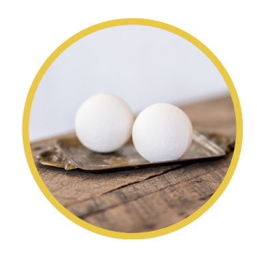
Bath Bombs Low waste and packaged in recycled cardboard clamshells