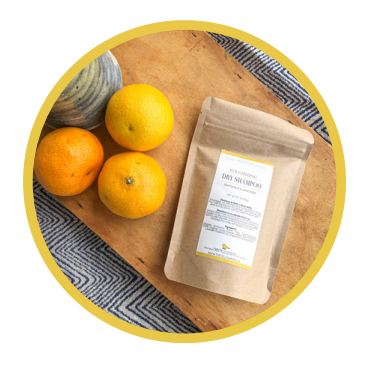
Dry Shampoo Zero waste and packaged in an eco-friendly recycled kraft paper pouch.