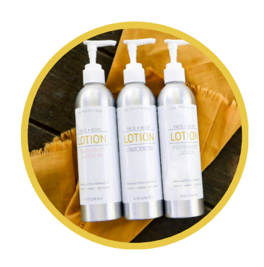
Lotion & Toners Low waste and packaged in recyclable aluminum bottles