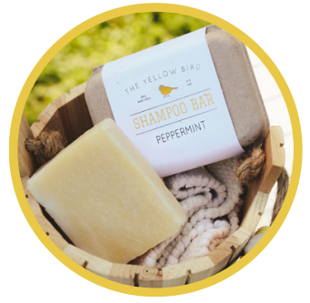
Zero waste and packaged in eco-friendly recycled cardboard clamshells

At The Yellow Bird, you can find zero waste products and eco-friendly products that are safe on skin and safe for the earth we live in. We also offer several of these zero waste products in bulk further helping you choose products that reduce the impact on the environment.