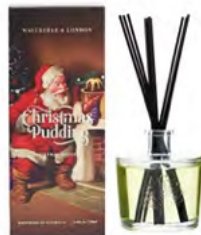
Christmas Pudding Diffuser