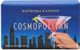
Cosmopolitan Soap Bar