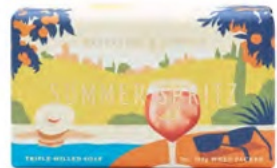
Summer Spritz Soap Bar