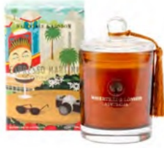
Espresso Martini Candle