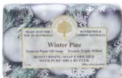
Winter Pine Soap Bar