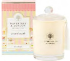
Ice Cream Candle