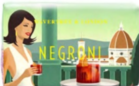
Negroni Soap Bar