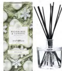
Winter Pine Diffuser