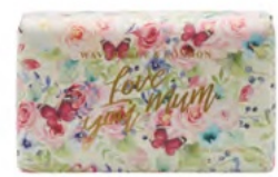
Love You Mum - English Rose Soap Bar