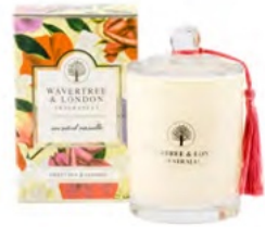
Sweet Pea & Jasmine Candle