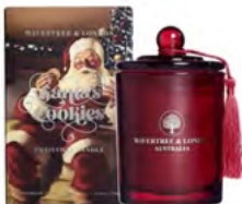
Santa's Cookies Candle