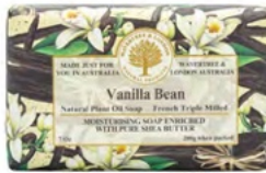
Vanilla Bean Soap Bar