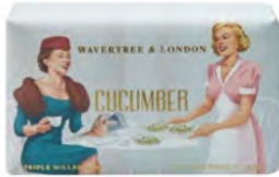
Cucumber Soap Bar