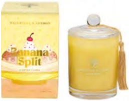
Banana Split Candle