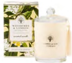
Frangipani & Gardenia Candle