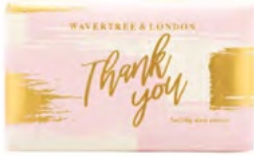
Thank You Pink - Beach Soap Bar