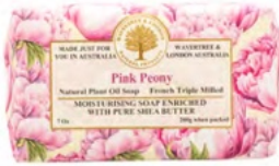
Pink Peony Soap Bar