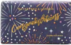
Congratulations - Peony Fragrance Soap Bar