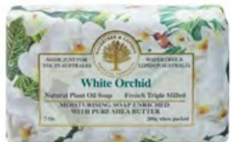
White Orchid Soap Bar