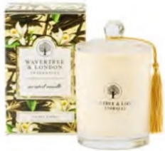
Vanilla Bean Candle