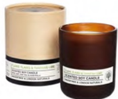
Ylang Ylang & Tahitian Lime Candle