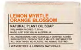
Lemon Myrtle & orange Blossom Soap Bar