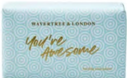
You're Awesome - Lemon Grass and Lemon Myrtle Soap Bar