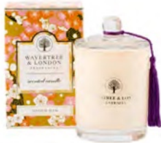
Japanese Plum Candle