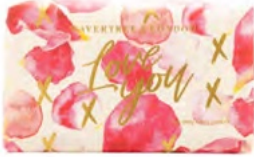
Love You Petals - Sweet Pea Soap Bar