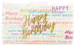
Happy Birthday Wrap - French Pear Soap Bar