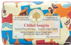
Chilled Sangria Soap Bar