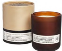
Vanilla, Cedarwood & Cinnamon Candle