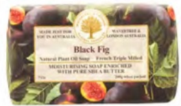
Black Fig Soap Bar