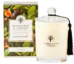
Black Fig Candle