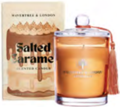
Salted Caramel Candle