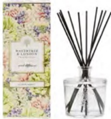
Flower Market Diffusers