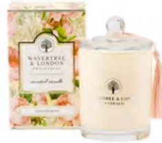
English Rose Candle