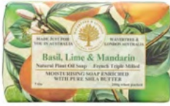
Basil Lime Mandarin Soap Bar