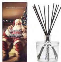
Santa's Cookies Diffuser