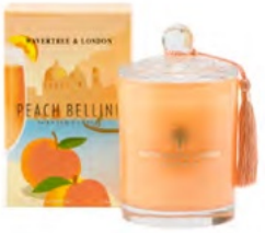
Peach Bellini Candle