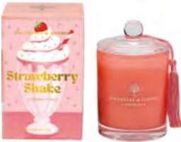
Strawberry Shake Candle