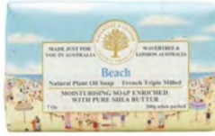
Beach Soap Bar