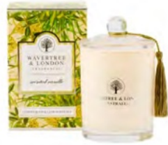
Lemongrass & Lemon Myrtle Candle