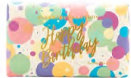
Happy Birthday Confetti - French Pear Soap Bar