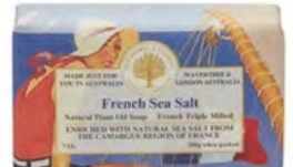
French Sea Salt Soap Bar