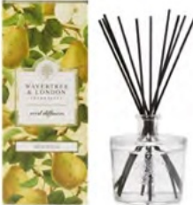
French Pear Diffusers