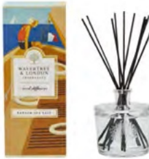
French Sea Salt Diffusers