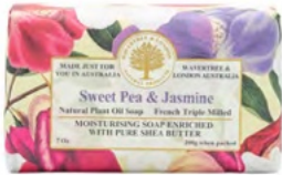
Sweet Pea & Jasmine Soap Bar