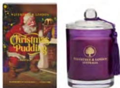
Christmas Pudding Candle