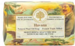
Havana Soap Bar