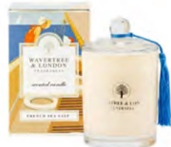
French Sea Salt Candle