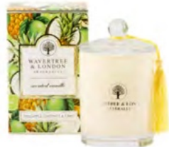
Pineapple, Coconut & Lime Candle