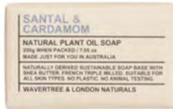
Santal & Cardamom Soap Bar