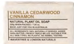
Vanilla, Cedarwood & Cinnamon Soap Bar