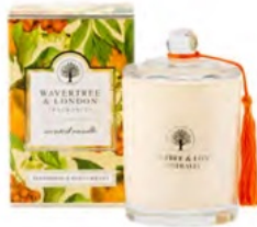
Persimmon & Red Currant Candle