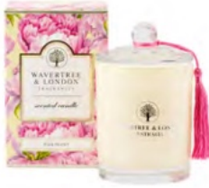
Pink Peony Candle