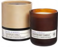
Basil & Neroli Candle