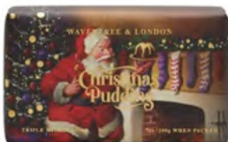
Christmas Pudding Soap Bar