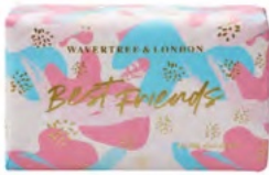
Best Friends - Pink Peony Fragrance Soap Bar