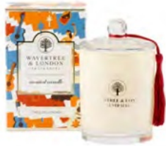
Chilled Sangria Candle