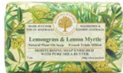
Lemongrass & Lemon Myrtle Soap Bar