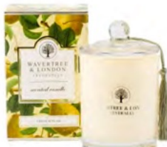
French Pear Candle