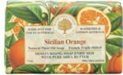
Sicilian Orange Soap Bar