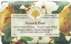
French Pear Soap Bar