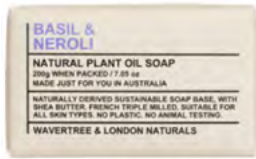
Basil & Neroli Soap Bar