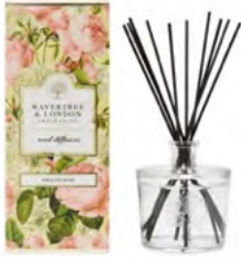
English Rose Diffusers