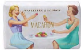
Macaron Soap Bar