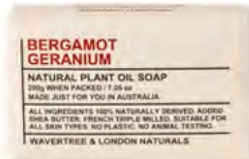
Bergamot & Geranium Soap Bar