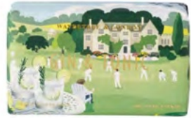
Gin & Tonic Soap Bar