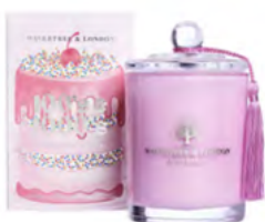
100's & 1000's Candle