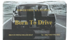
Born To Drive - Oakmoss Soap Bar