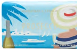
Prosecco Soap Bar