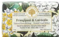
Frangipani & Gardenia Soap Bar