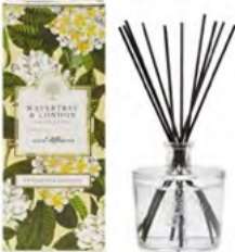
Frangipani & Gardenia Diffusers