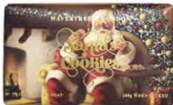
Santa's Cookies Soap Bar