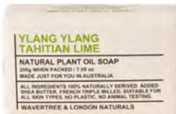
Ylang Ylang & Tahitian Lime Soap Bar