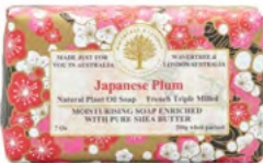
Japanese Plum Soap Bar