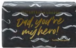
Dad, You're My Hero! - Oakmoss Soap Bar