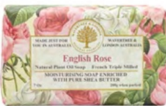
English Rose Soap Bar