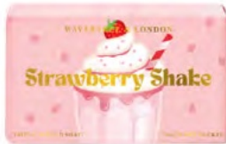
Strawberry Shake Soap Bar