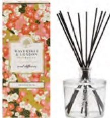
Japanese Plum Diffusers