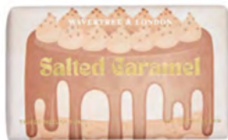
Salted Caramel Soap Bar