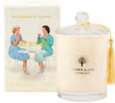
Lemon Meringue Candle