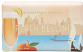
Peach Bellini Soap Bar