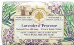
Lavender d'Provence Soap Bar