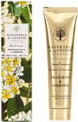
Frangipani & Gardenia Hand Cream