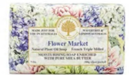
Flower Market Soap Bar