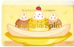
Banana Split Soap Bar