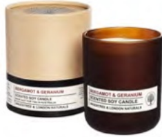
Bergamot & Geranium Candle