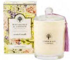
Flower Market Candle