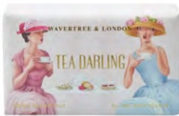
Tea Darling Soap Bar