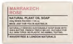
Marrakech Rose Soap Bar