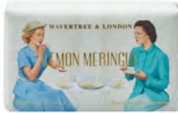
Lemon Meringue Soap Bar