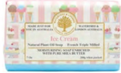
Ice Cream Soap Bar