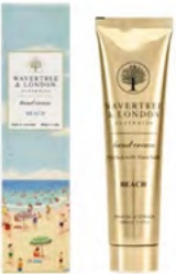
Beach Hand Cream