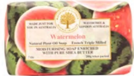
Watermelon Soap Bar