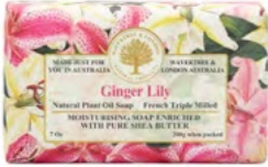
Gingerlily Soap Bar