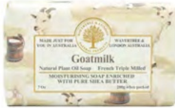
Goatmilk Soap Bar