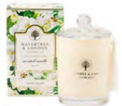
White Orchid Candle