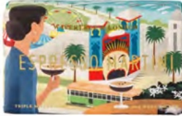
Espresso Martini Soap Bar