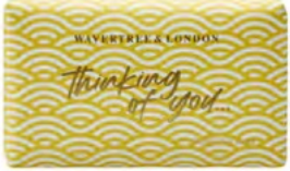
Thinking Of You Yellow - Frangipani & Gardenia Soap Bar