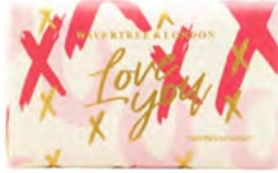
Love You XO - Sweet Pea Soap Bar