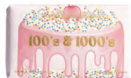
100's & 1000's Soap Bar