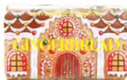
Gingerbread Soap Bar