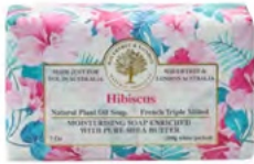
Hibiscus Soap Bar