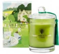
Gin & Tonic Candle