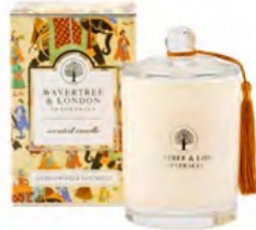
Sandalwood & Patchouli Candle