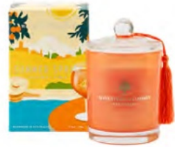
Summer Spritz Candle