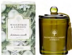
Winter Pine Candle