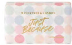
Just Because - White Orchid Soap Bar