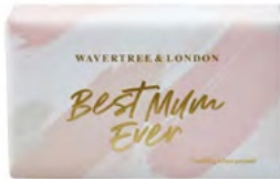
Best Mum Ever - Frangipani and Gardenia Fragrance Soap Bar