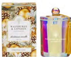
Christmas Tinsel Candle