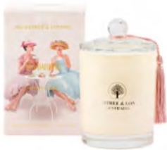
Tea Darling Candle