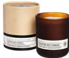
Santal & Cardamom Candle