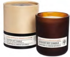
Lemon Myrtle & Orange Blossom Candle