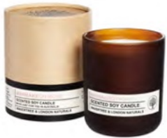
Marrakech Rose Candle