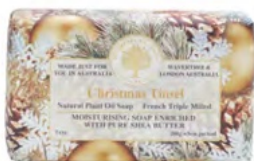
Christmas Tinsel Soap Bar