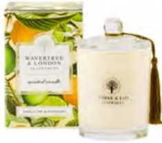
Basil Lime Mandarin Candle