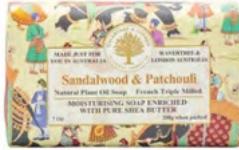
Sandalwood & Patchouli Soap Bar