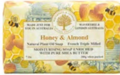
Honey & Almond Soap Bar