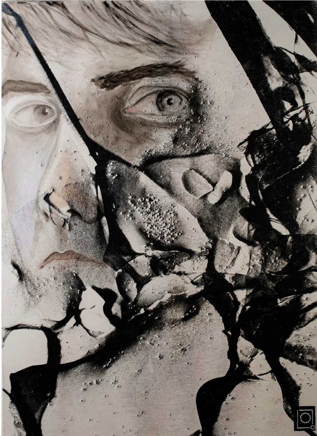
Self-Portrait, 2017 oil and silver gelatin on canvas 39 x 31 1/2 inches 100 x 80 cm