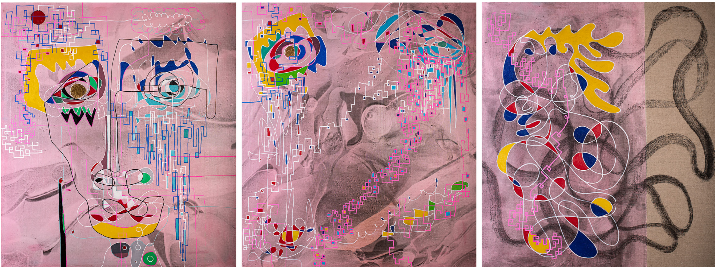
Instructions on how to disappear in three moments (pink) [full view], 2020 oil, silver gelatin, gold leaf and markers on linen, three panels 39 x 35 inches (each panel), 39 x 105 inches (triptych) 100 x 89 cm (each panel), 100 x 266.7 cm (triptych)