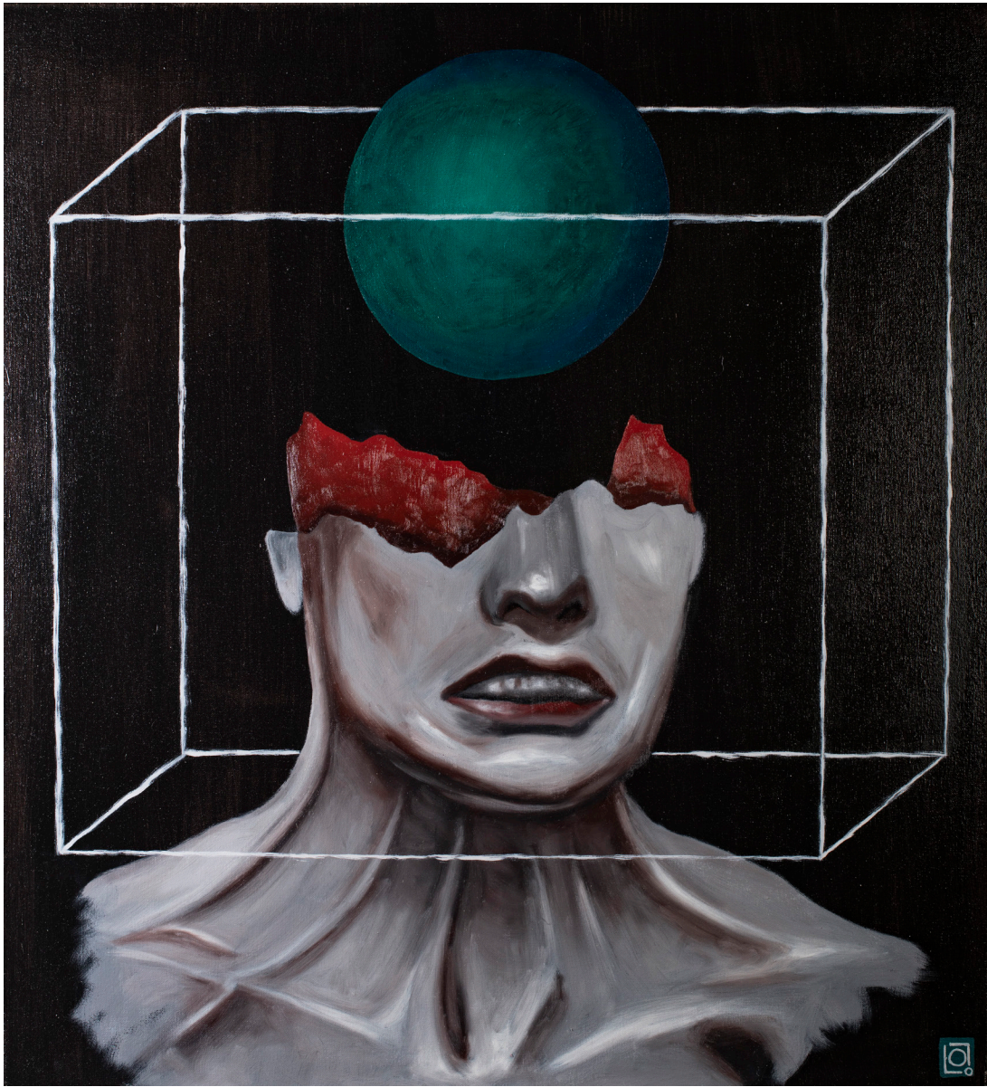
Vacuum , 2020 oil on canvas 31 1/2 x 28 3/4 inches 80 x 73 cm