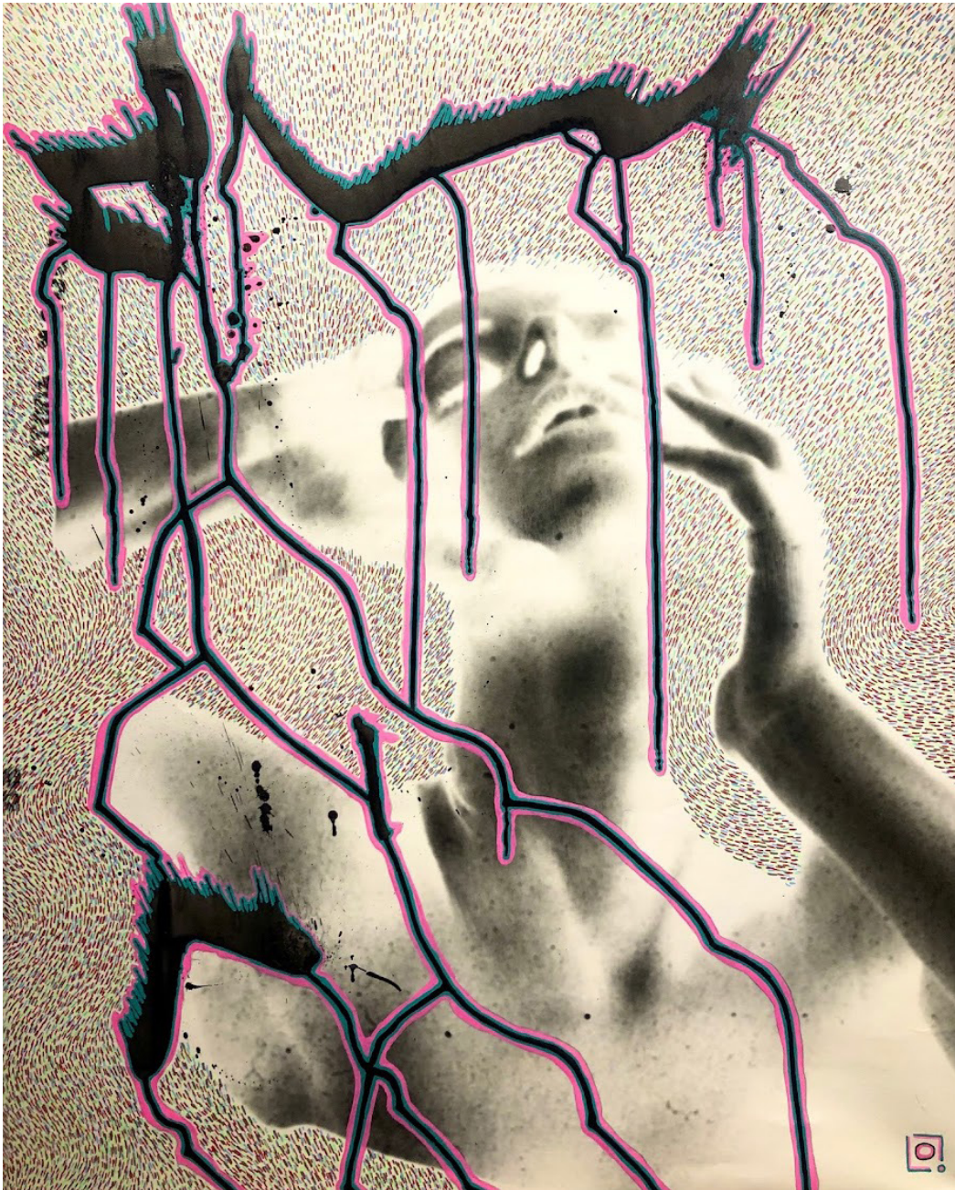
Experiment, 2021 ink and acrylic pen on silver gelatin print 39 x 31 1/2 inches 100 x 80 cm