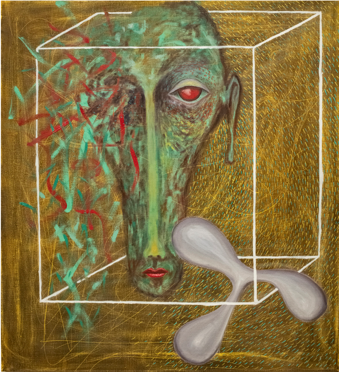
Cara Larga , 2021 oil on canvas 39 x 35 inches 100 x 89 cm