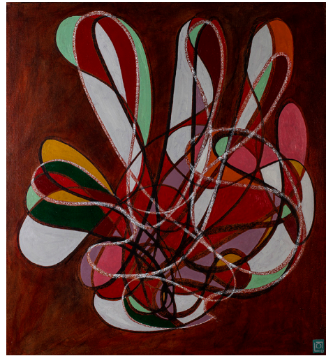
Three studies of my left hand, 2020 oil on canvas 31 1/2 x 28 3/4 inches (each panel), 31 1/2 x 86 1/4 (triptych) 80 x 73 cm (each panel), 80 x 219 cm (triptych)