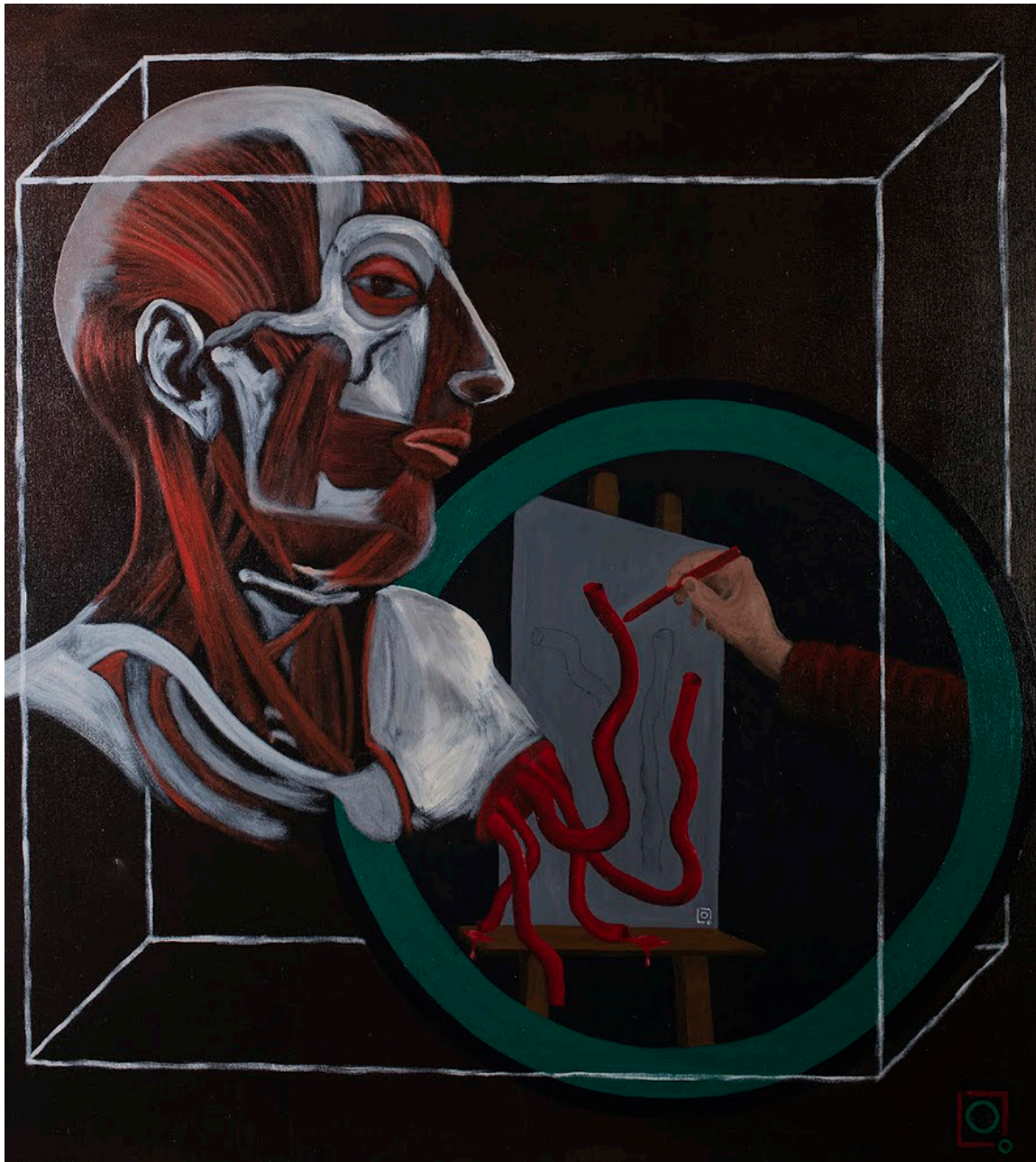
Mirror , 2020 oil on canvas 39 x 35 inches 100 x 89 cm