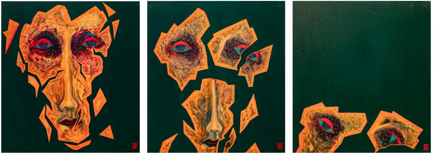
Instructions on how to disappear in three moments (green), 2020 oil on canvas, three panels 31 1/2 x 28 3/4 inches (each panel), 31 1/2 x 86 1/4 (triptych) 80 x 73 cm (each panel), 80 x 219 cm (triptych)