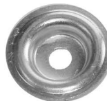
#832 silver cup washer (small hole)