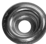
#833-8 gold cup washer (large hole)