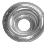
#832-8 silver cup washer (large hole)