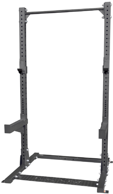
COMMERCIAL HALF RACK SPR500