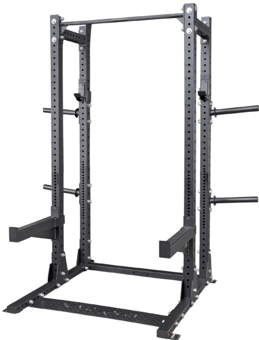
COMMERCIAL EXTENDED HALF RACK SPR500BACK