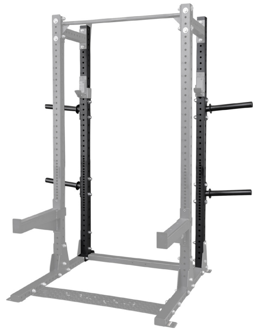
COMMERCIAL HALF RACK EXTENSION SPR500HALFBACK