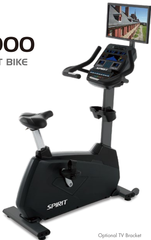
Optional TV Bracket Available, Built in Power Port for TV Remote