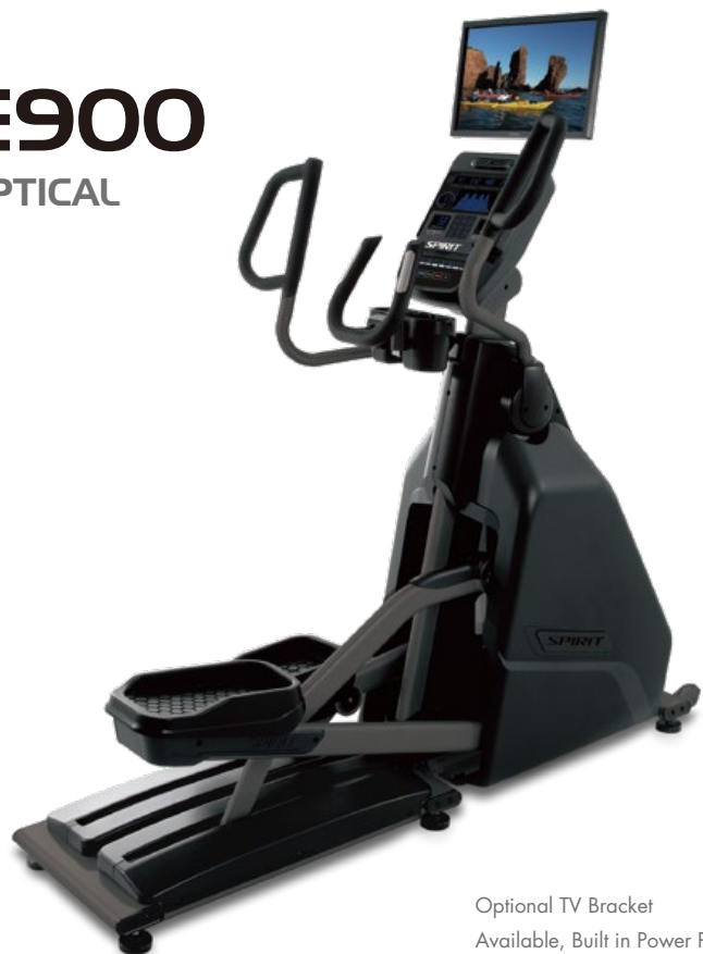
Optional TV Bracket Available, Built in Power Port for TV Remote