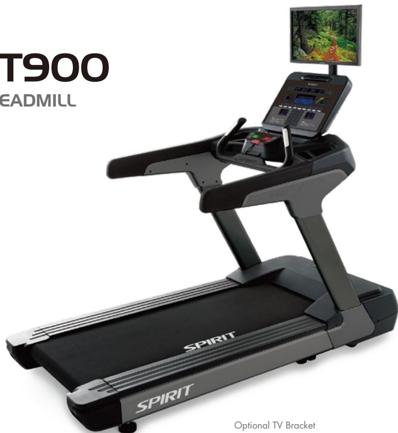
Optional TV Bracket Available, Built in Power Port for TV Remote