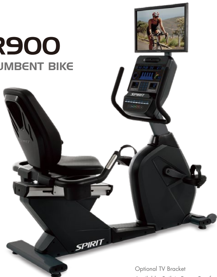
Optional TV Bracket Available, Built in Power Port for TV Remote