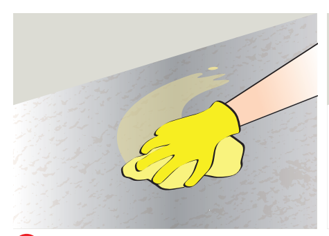
4 Apply the polish to the metal item or surface.