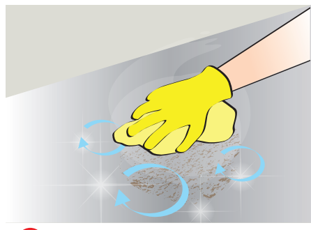
6 Rub gently in a circular motion if there are heavily tarnished areas.