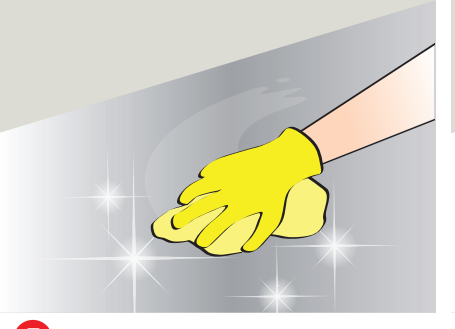
5 Restore the shine and luster by rubbing a dry cloth over the metal item.