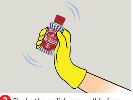
2 Shake the polish can well before