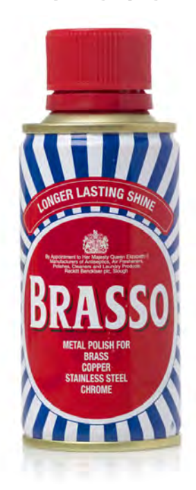
Health & Safety Please refer to relevant COSHH Safety Data Sheet