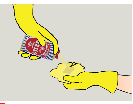
3 Soak a clean, dry cloth with the polish.