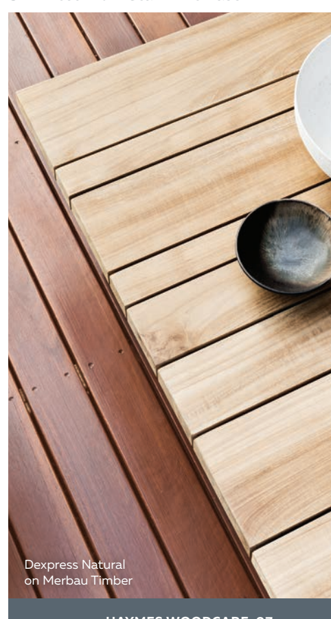
HAYMES WOODCARE 07