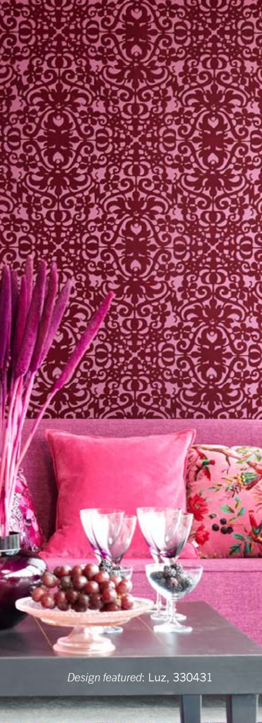
Design featured: Luz, 330431