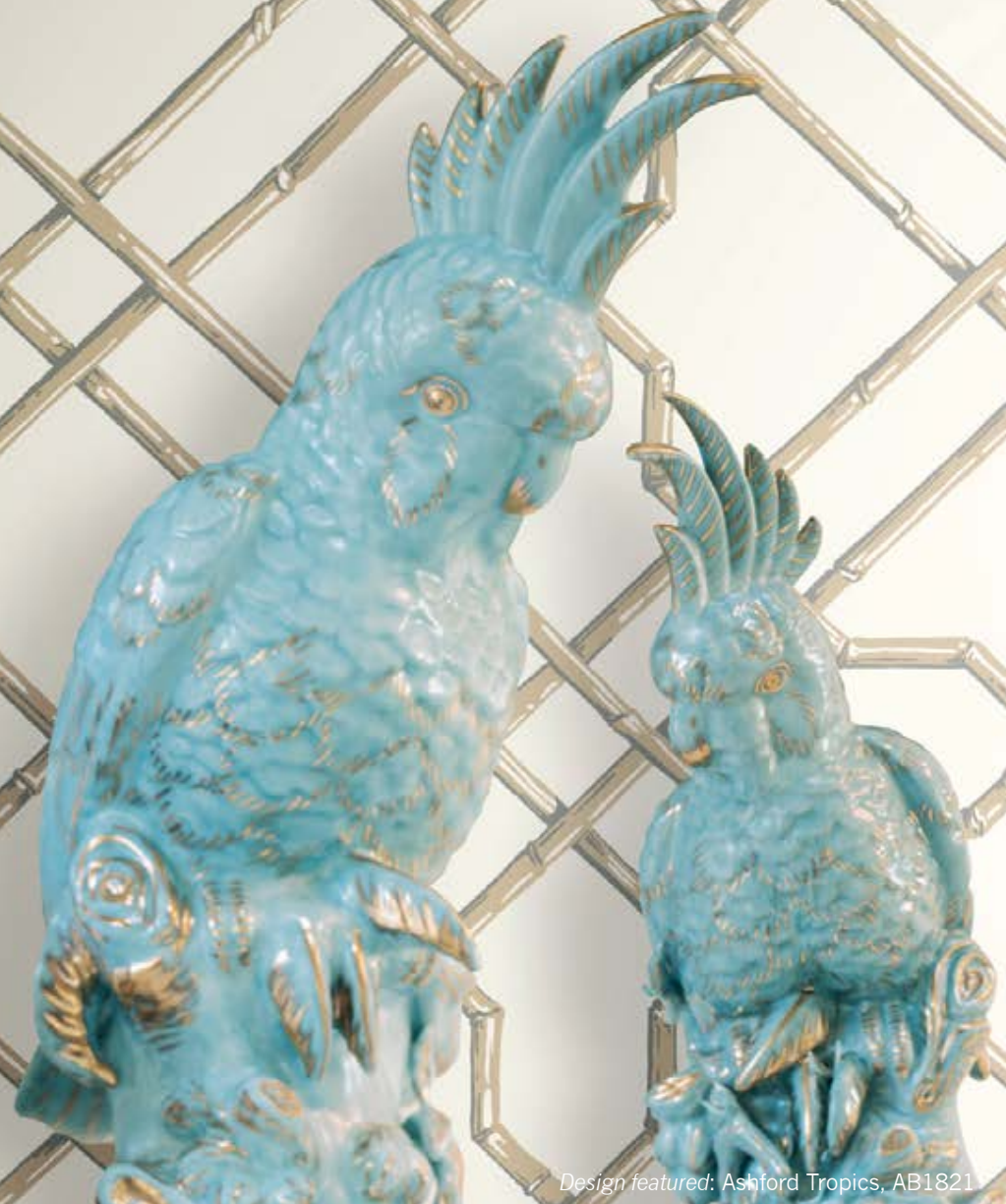
Design featured: Ashford Tropics, AB1821