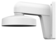
DS-1273ZJ-130 Wall Mount