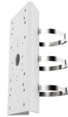
DS-1275ZJ-SUS Vertical Pole Mount