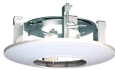
DS-1227ZJ In-ceiling Mount