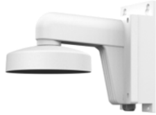
DS-1273ZJ-130B Wall Mount