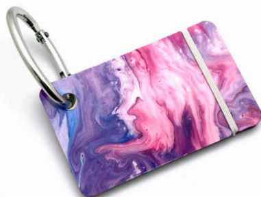
Purple & Pink Marble PKMBL