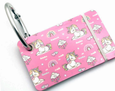
Pink Unicorn PKUCN