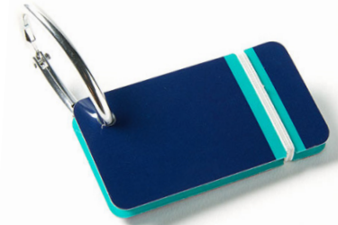
Navy & Teal NVYTL