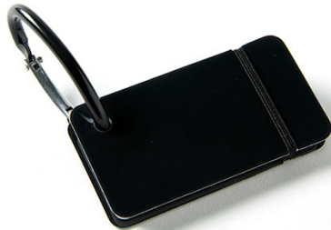
All Black BLACK