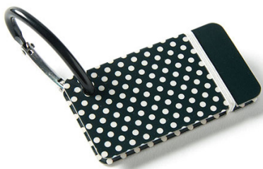
Black & White Polkas BWPLK