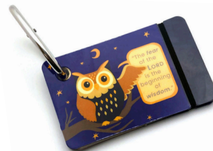
Wise Owl - Prov 1:7* WSOWL