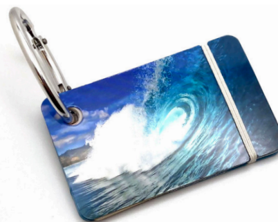
Wave - Ps 39:4* WVELV