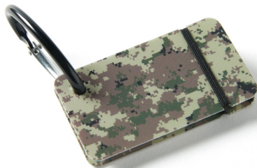
Desert Camo DCAMO