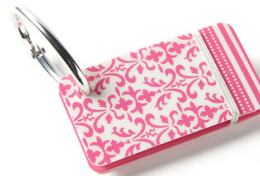
Pink Victorian PVCTN