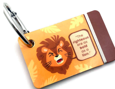
Bold Lion - Prov 28:1* BLDLN