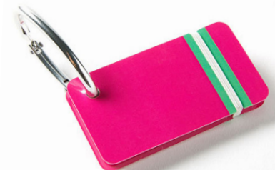
Hot Pink & Green HPGRN