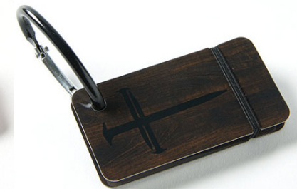
Cross & 3 Nails CSNLS