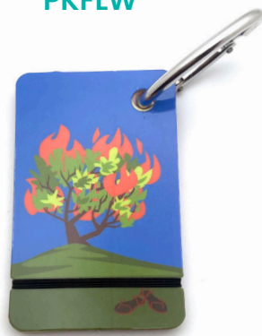
Burning Bush - Ex 3:2&5* BNBSH