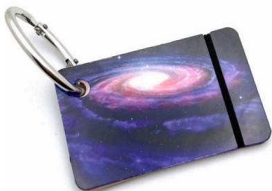
Galaxy - Job 26:14* GALAX