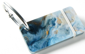
Blue & Gold Marble BGMBL