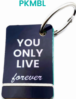
YOLF - John 11:25* YOLFJ