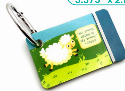
Jesus' Sheep - Jn 10:27-28* JSHEP