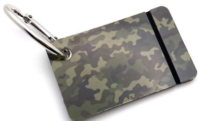
Forest Camo FCAMO