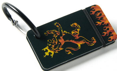
Lion of Judah LNJDH