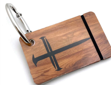
Cross & 3 Nails CS3NL