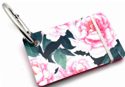
Pink Flowers PKFLW