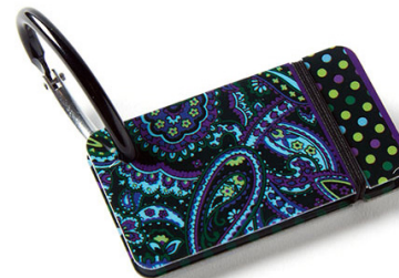
Purple Paisley PPSLY