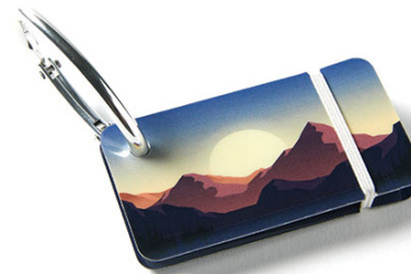
Desert Mountain DSMTN