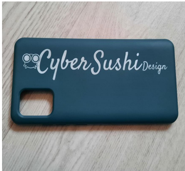
Phone case(Silica Gel)