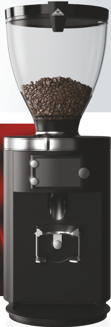
High capacity and great taste.

THE FASTEST & MOST ADVANCED premium espresso grinder of its class on the market.