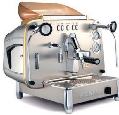
Automatic - 1 Group