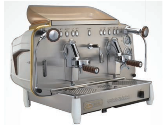
Automatic - 2 Group

WOOD DETAILS AVAILABLE FOR WHITE MODEL WOOD ONLY