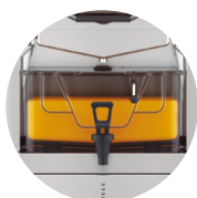
Speed S +plus Tank Podium