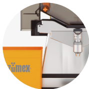
Speed S +plus Self Service