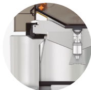
Speed S +plus Self Service Podium