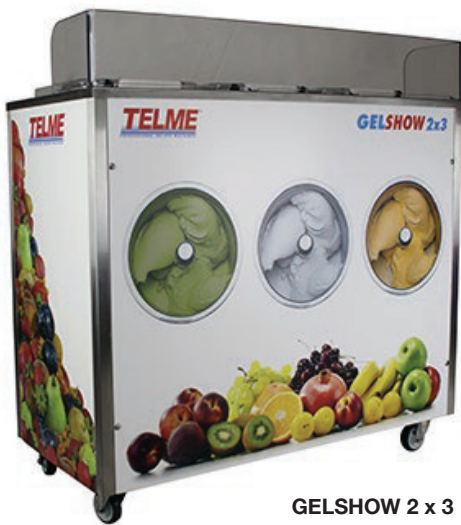
GELSHOW 2 x 3