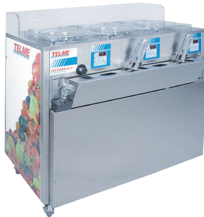
GELSHOW 4 x 3