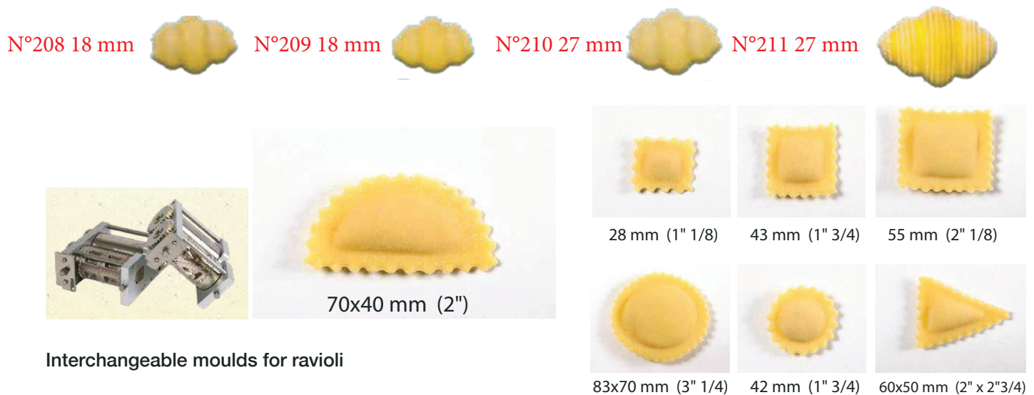
Interchangeable moulds for ravioli