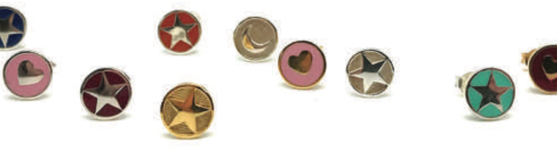
Matching enamel studs are available. See website for details.