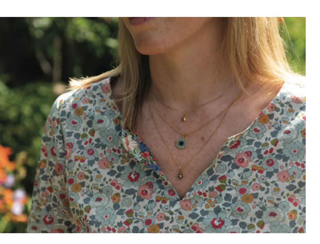
Available in size S/M and M/L.