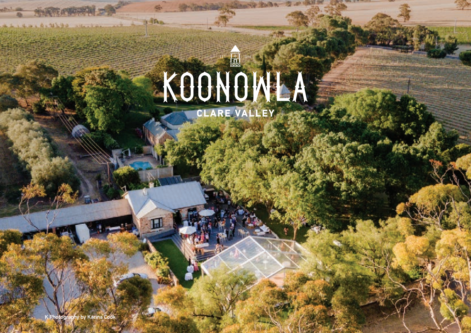
K Photography by Karina Cook