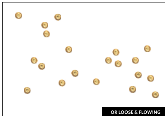
OR LOOSE & FLOWING